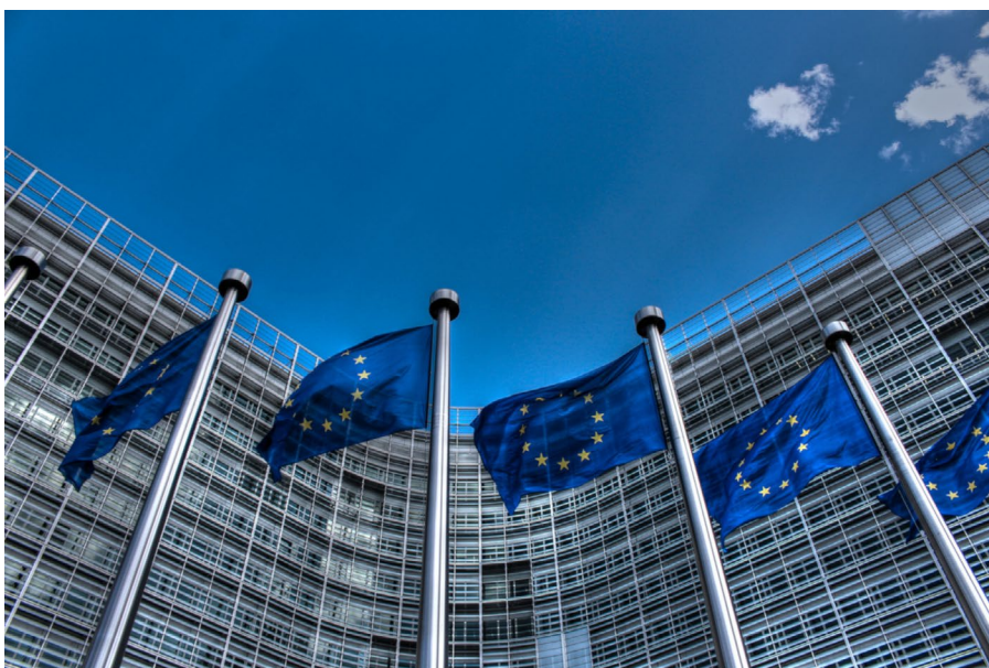
Flags of the European Union in front of the Berlaymont, headquarters of the European Commission, Brussels (Belgium)

“ Es ist von entscheidender Bedeutung, dass die EU eine klarere Vorstellung für die Anfälligkeit ihrer Landwirtschaftssysteme entwickelt und innovative Strategien ausarbeitet, um die Resilienz durch Anpassungs- und Wandlungsfähigkeit zu erhöhen. ”