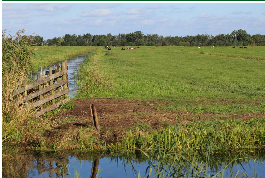
Farming systems are local networks of comparable types of farms and other actors that interact and are responsible for private and public goods in a specific regional context.

Commissioner must secure qualified majorities in the Parliament and the Council. This makes it unlikely that a CAP reform will create a coordinated long-term vision unless the negotiations focus more on realising a shared understanding of challenges and the CAP's effects on farming systems' resilience. It is essential that the EU develops a clearer sense of the vulnerabilities of its farming systems along with innovative strategies to increase resilience through adaptability and transformability. This is much preferable to trying to maintain a status quo co-produced by historical policies that in major ways reinforce robustness.