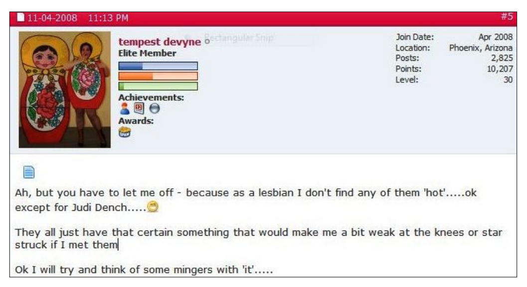
Figure 22 – Discussing Dench's sex appeal (screenshot from Ministry of Burlesque online forum, www.ministryofburlesque.com)

According to Lawrence Ferber, Dench's status as a lesbian icon is undeniable (2002). In an interview, for gay and lesbian newsmagazine The Advocate , Judi Dench is informed of her status: