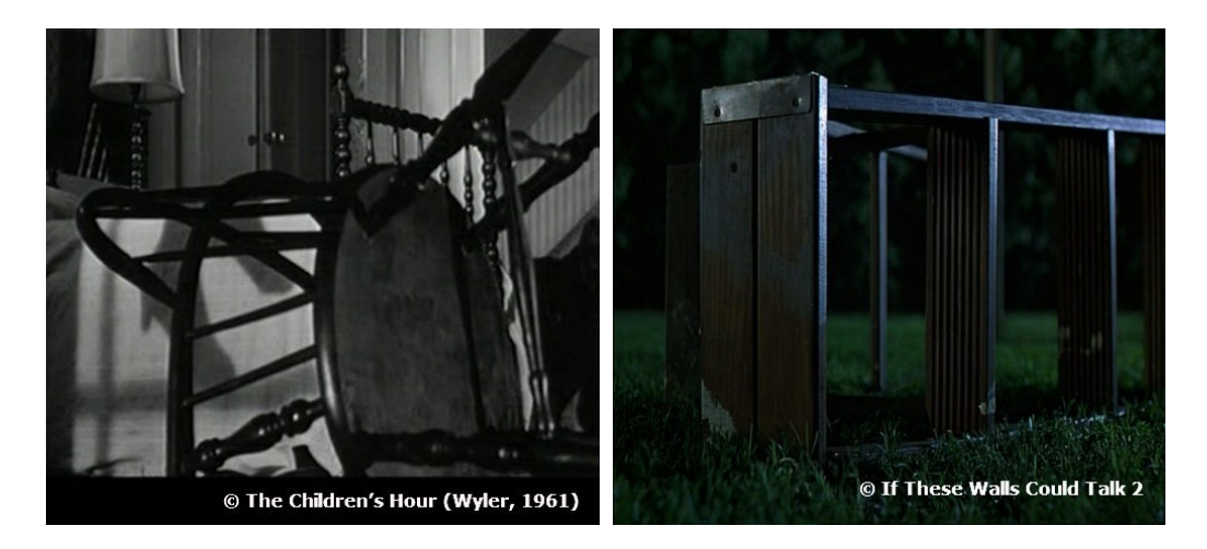
Figure 8 – Intertextually linked screenshots: the fallen chair in The Children's Hour (Wyler, 1961, left) denoting suicide and the fallen ladder implying a fatal accident in If These Walls Could Talk 2 ('1961', right)

There is another intertextual reference that links The Children's Hour with If These Walls Could Talk 2 . Comparing two screen shots (figure 8) a link between both unhappy endings is established. While the fallen chair (left) indicates Martha's suicide (in what has been identified as a conventional 'killing-off' practice for lesbian characters in film), the fallen ladder (right) confirms the concept of the frail old female body – in compliance with the concept of ageing as decline. The double definition as ghostly that results from the intersection of lesbian sexuality and old age is here visually presented.