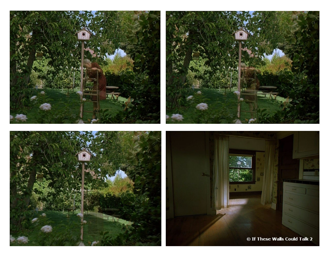
Figure 9 – Gradual dissolve: Edith's (Vanessa Redgrave) ghostly disappearance at the end of '1961', If These Walls Could Talk 2

sequence in terms of Edith's desire to nurture (birds and eggs), confirming her position 'as a guardian of future life, great and small' (2002, p93).