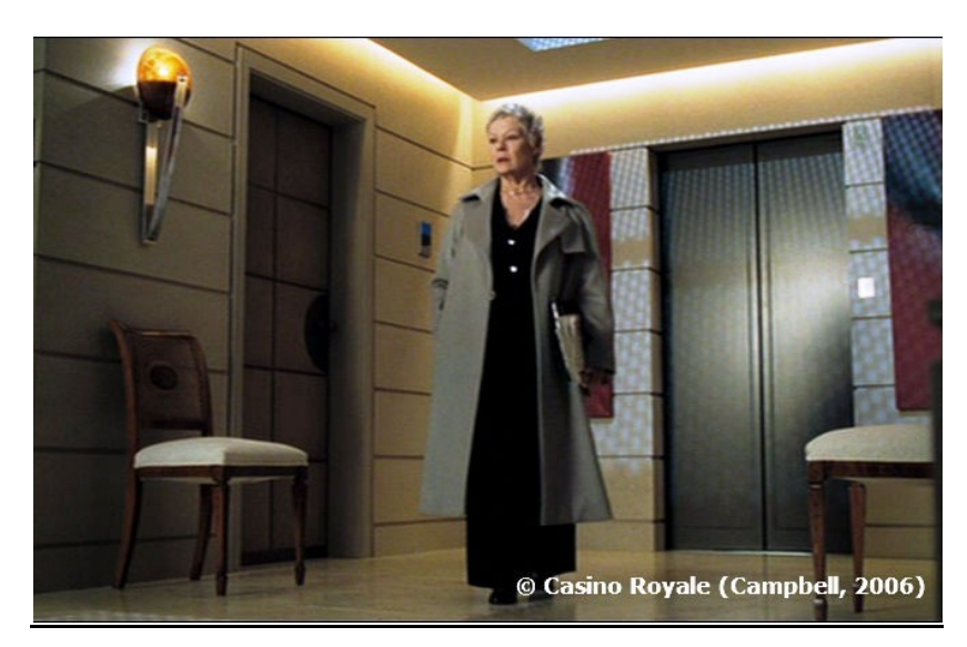
Figure 25 – 'Reboot' M: Dench in power suit in Casino Royale (Campbell, 2006)

Shortly before the release of Casino Royale , the rumour spread that director Martin Campbell 'nearly made M a lesbian,' according to several entertainment websites and James Bond fan forums.<sup>122</sup> The possibility of queering M is both aligned with and further corroborates a lesbian appropriation of this character: