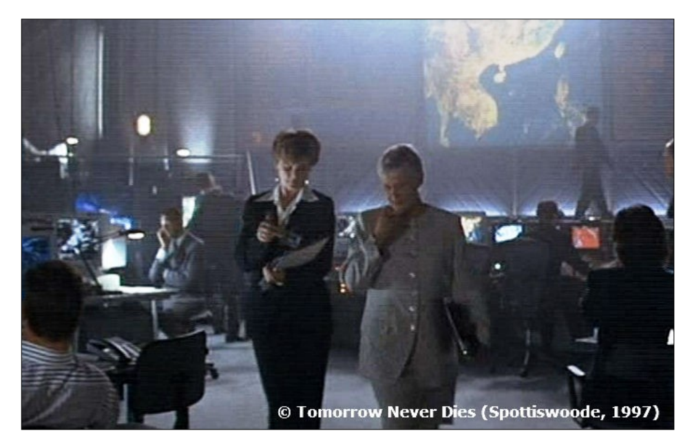
Figure 24 – Female bonding between Moneypenny (Samantha Bond) and M (Judi Dench) in Tomorrow Never Dies (Spottiswoode, 1997)