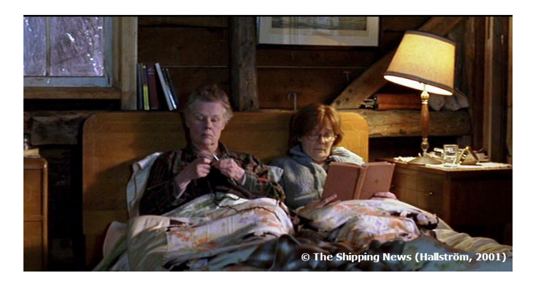
Figure 11 – A glimpse into domestic bliss: Agnis (Judi Dench) and Mavis (Nancy Beatty) in The Shipping News (Hallström, 2001)

The difference is that in this film, Agnis is not confined to widowhood and an association to a past. The difference between the colour and the blackand-white photographs further supports this idea; as opposed to Vera, Agnis' presence is located in the here and now (figure 10, right). In fact, in a third moment, the formulaic theme is surpassed and the possibility of companionship and happiness is located in the present, instead of confined to the past. In a brief scene, Agnis is depicted sitting in bed next to her colleague Mavis (Nancy Beatty, see figure 11).