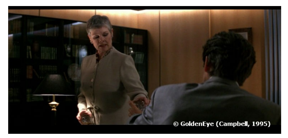
Figure 23 – A moment of tension between M (Judi Dench) and Bond (Pierce Brosnan) in GoldenEye (Campbell, 1995)

In the audio commentary to GoldenEye the director Martin Campbell and Michael G. Wilson (co-producer) mention their decision 'to make the women a little tougher, a little more independent, aggressive – in all departments' (1995). In line with this decision to modernise the Bond formula and supposedly inspired by the appointment of Stella Rimmington as the director-general of MI5 (between 1992 and 1996), it was suggested to 'make' M a woman. Notwithstanding this recent appointment of a woman to a similar post of command, 'stepping outside of what had gone before' (Campbell and Wilson, 1995) within the Bond universe was considered a bold move. The solution was in the casting – 'If you do get a woman, get a star' (Campbell and Wilson, 1995). The star chosen was Judi Dench.