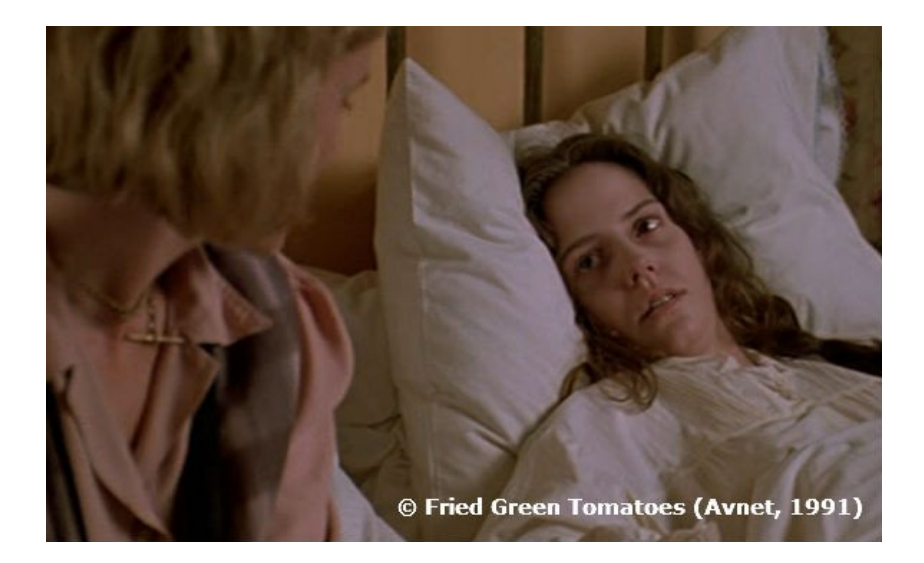
Figure 1 – Deathbed scene: Ruth's (Mary-Louise Parker, right) last moment with Idgie (Mary-Stuart Masterson) in Fried Green Tomatoes (Avnet, 1991)

After a final deathbed scene (figure 1), Ruth 'disappears' and Idgie becomes a widow.