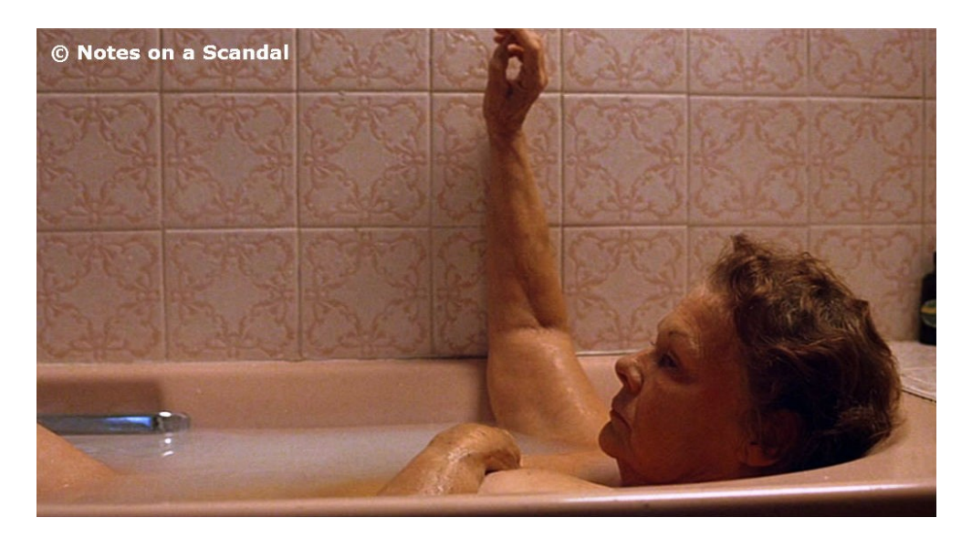
Figure 15 – The ageing body as abject 'other' in Notes on a Scandal

Sheba 'and her like' are the affluent, attractive, young women who constitute the norm/alised category against which Barbara emerges as the 'other'.