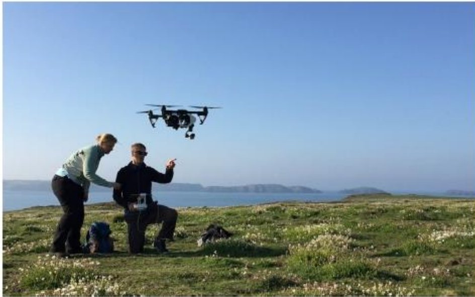
Figure 3. DJI Inspire 1 quadcopter unmanned aerial vehicle (UAV) fitted with a DJI FC350 camera being used to survey Lesser Black-backed Gull nests on Skokholm Island, UK, 2016 (Rush et al. 2018).

The magnitude of behavioural response depends on the type of UAV; flight parameters, including altitude and speed; take-off location relative to the colony; and the species being monitored (Rümmler et al. 2016, Brisson-Curadeau et al. 2017, Mulero-Pázmány et al. 2017, Rush et al. 2018, Weimerskirch et al. 2018, Irigoien-Lovera et al. 2019). Rümmler et al. (2018) found that Adélie Penguins Pygoscelis adeliae reacted to a small octocopter UAV at the highest test altitude of 50 m, whereas Gentoo Penguins Pygoscelis papua only reacted below 30 m. In another study, Adélie Penguins did not respond to fixed-wing electric UAVs at 350 m altitude but did show vigilance and increased activity levels in response to UAVs flown at the same height but powered by a piston engine (Korczak-Abshire et al. 2016). Deciding on a suitable flight protocol to minimize disturbance is therefore difficult, as it will vary between and within species depending on a variety of factors. For example, there may be intra-species variation in response at different locations due to variable aerial predation levels or variation in response by the same colony at different times of the year. Consequently, it seems wise that test flights should always be conducted before using UAVs for seabird monitoring.