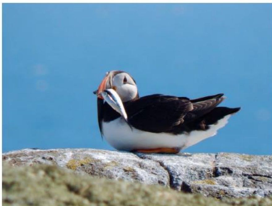
Figure 5. Photograph of an Atlantic Puffin carrying prey, submitted to RSPB Project Puffin UK.