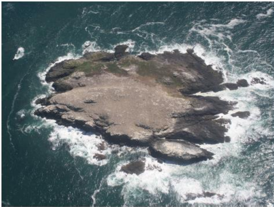
Figure 2. Aerial photograph of the gannetry on Grassholm Island, UK, 2015.

The benefits of reduced disturbance and increased accuracy must be balanced against the high purchase and operational costs of manned aircraft (Hutchinson 1980). This includes the price of fuel, hiring a pilot with a professional aviation licence and, if photographs or videos are desired, camera installation and hiring a camera operator (Wilhelm et al. 2015, Nowak et al. 2019). In the past, photographs were taken through windows using handheld cameras, whereas most studies today install fixed cameras to improve image quality and consistency (Hutchinson 1980, Wilhelm et al. 2015). Additionally, manned aircraft are restricted in where they can operate, as they require a nearby airport, fulfilment of aviation procedures and are not manoeuvrable over small areas (Nowak et al. 2019). Moreover, at-sea aerial surveys are not advised in winds greater than Beaufort 4 to reduce the likelihood of inaccurate counts, as can happen, for example, if white wave caps are confused with gulls (Thaxter & Burton 2009).