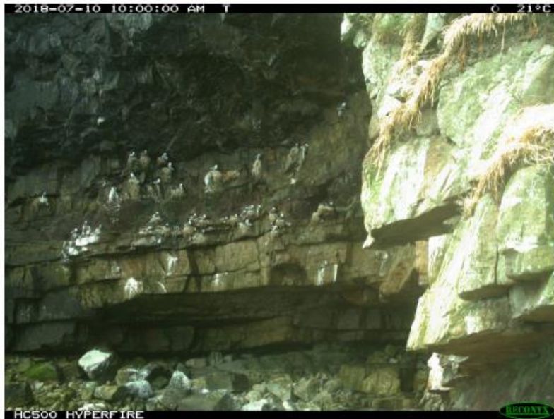
Figure 4. Time-lapse photograph of nesting Black-legged Kittiwakes at Protheroes Dock, Skomer Island, UK, 2018.

As well as their diverse range of uses, time-lapse cameras are unlikely to have an adverse effect on the wildlife they monitor, provided they are installed and maintained outside the breeding season and are located at a safe distance from breeding birds (Merkel et al. 2016). Determining a 'safe' distance is difficult, but the distance kept by fieldworkers could be a provisional minimum (Joint Nature Conservation Committee 2016). Limited disturbance also means cameras can collect data regardless of abiotic conditions. For example, the UK 'Seabird Count' instructs surveyors to avoid visiting colonies in winds stronger than Beaufort 4 or during heavy and continuous rain, as disturbance during wet weather can leave eggs and chicks vulnerable to chilling and weather conditions can affect colony attendance, so that this strict protocol helps to ensure count comparability across years and colonies (Joint Nature Conservation Committee 2016).