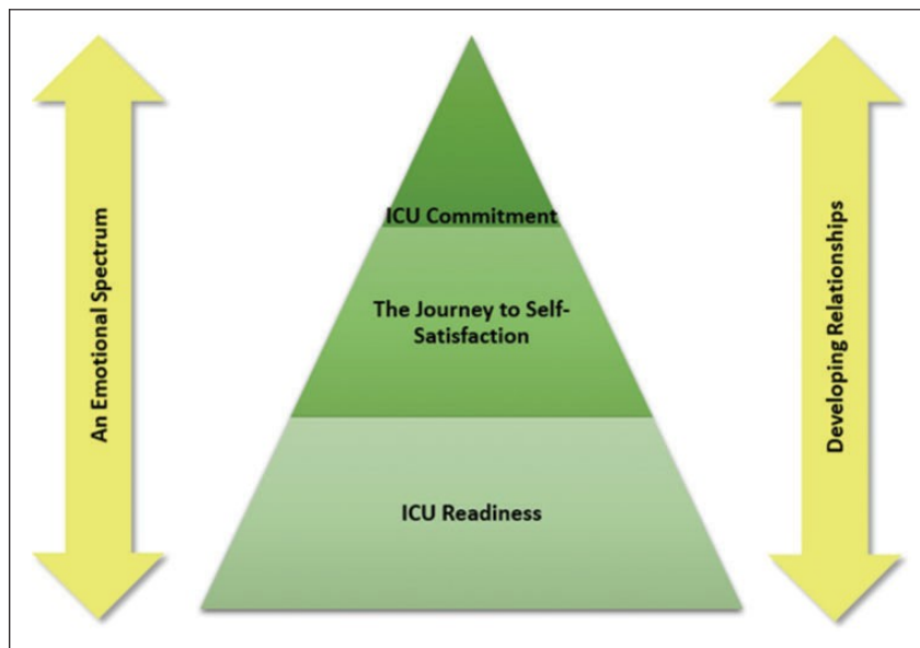
Figure 2. The Newly Qualified Nurses' journey in Critical Care.

Those findings with direct practice implications will now be discussed further. Despite the inclusion of international studies, it is beyond the scope of this review and the author's expertise to critique the domestic health policy of other countries. Consequently, the discussion of findings takes place within a UK context, but the findings may have relevance in other healthcare systems, and the reader may assess their transferability.