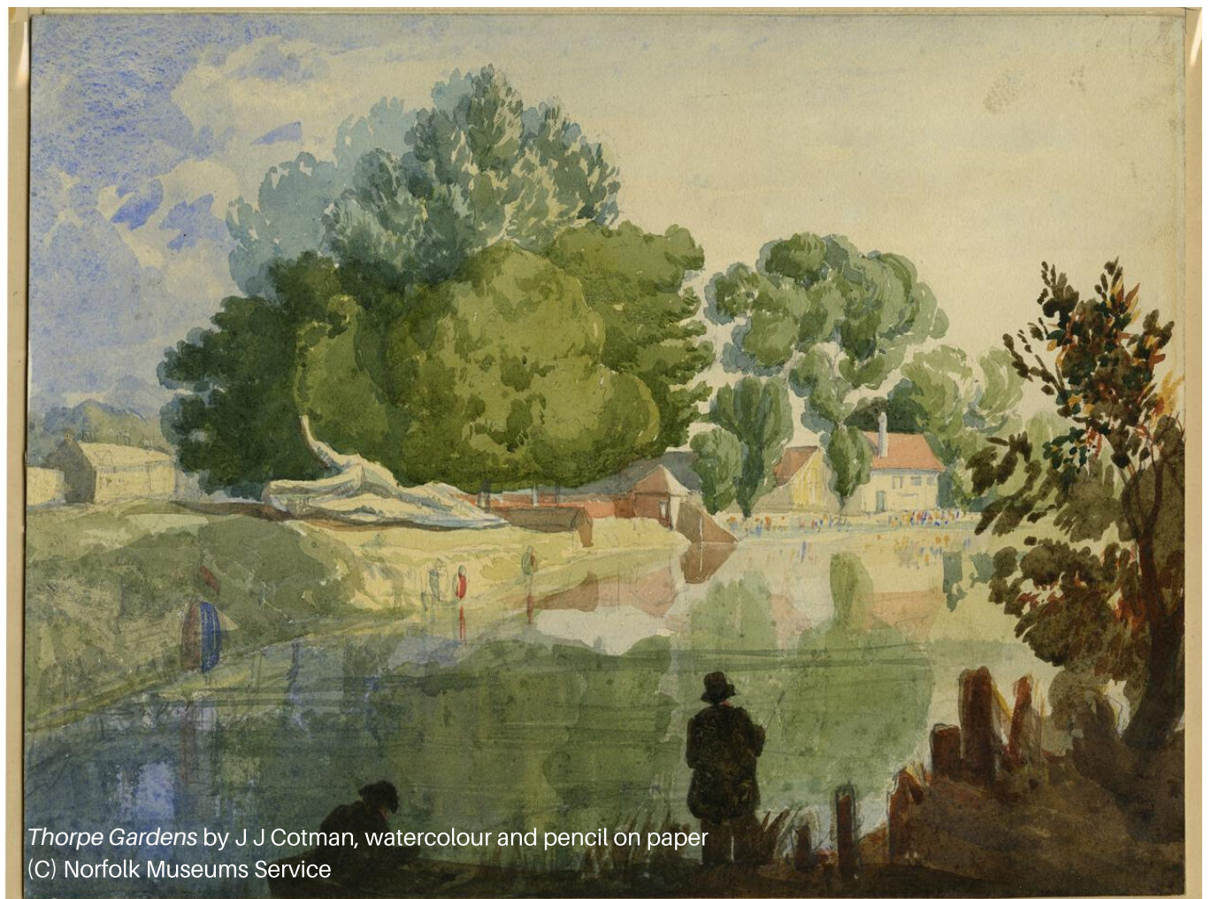
Thorpe Gardens by J J Cotman, watercolour and pencil on paper