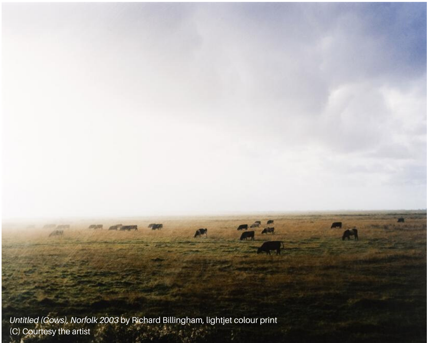
Untitled (Cows), Norfolk 2003 by Richard Billingham, lightjet colour print