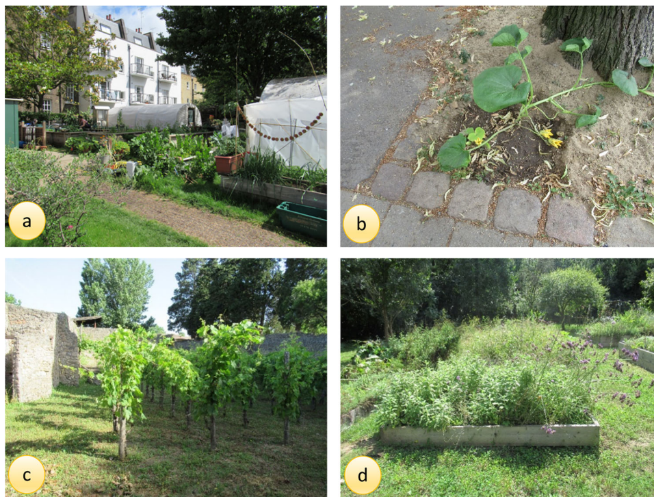
Fig. 3 International example of urban agriculture. a Calthorpe Project Community Garden, London, United Kingdom. The Calthorpe inner city community garden and centre exists to improve the physical and emotional wellbeing of those who live, work or study in Camden, London and surrounding areas, b guerrilla gardening in Berlin, Germany, c Roman ancient grape varieties grown in Pompeii Archaeological Park, Italy and (d) Hortus Urbis is the first edible garden with solely ancient Roman plants, Rome, Italy (Photographs taken by Alessio Russo, June 2018).