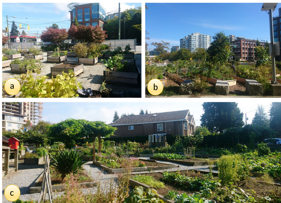
Fig. 2 City-wide urban agriculture and EGI outlets found throughout Greater Vancouver, Canada. a Oak and 41st Community Garden, b John McBride Community Garden and c Burquitlam Community Garden Park (Photographs taken by Giuseppe T. Cirella, September 2018).