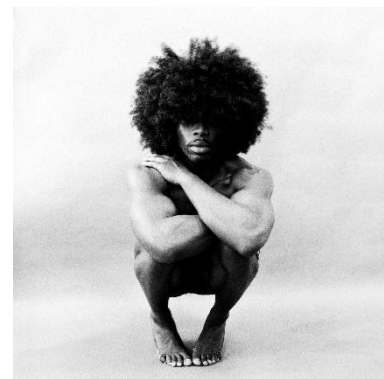
12. Rotimi Fani-Kayode Untitled, 1985 © Rotimi Fani-Kayode Courtesy of Autograph, London