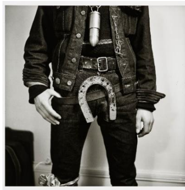
11. Karlheinz Weinberger Horseshoe Buckle , 1962 © Karlheinz Weinberger. Courtesy Galerie Esther Woerdehoff