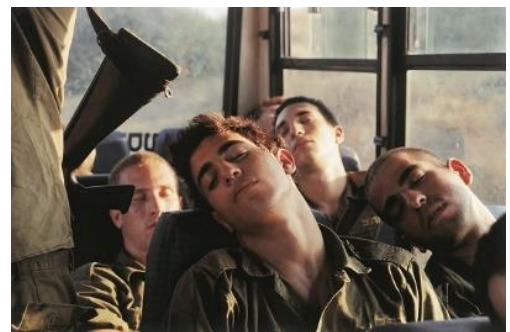
8. Adi Nes Untitled , from the series Soldiers , 1999