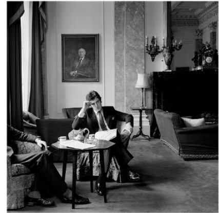
Newspapers are no longer ironed, Coins no longer boiled So far have Standards fallen.