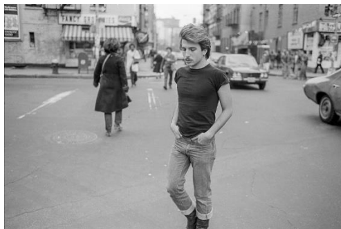
7. Sunil Gupta Untitled 22 from the series Christopher Street , 1976