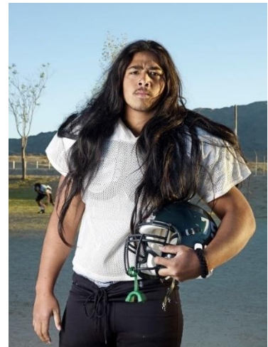
10. Catherine Opie Rusty , 2008