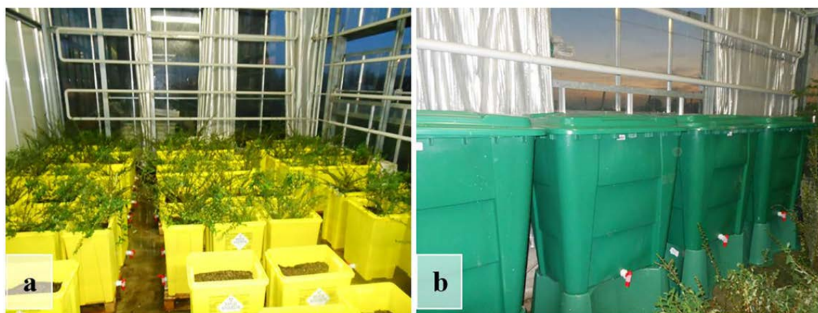
Figure 2. Photo of the greenhouse experiment at the University of Florence, Italy: (a) bioretention pot prototypes, (b) 200-L plastic water storage tanks.

70 plastic pot prototypes (Figure 1) with a truncated pyramid shape (418 x 310 mm, 347 x 245 mm base, and 575 mm height) with lateral taps at the bottom, were put in a greenhouse facility at the University of Florence in Sesto Fiorentino, Italy, in October 2013 (Figure 2).