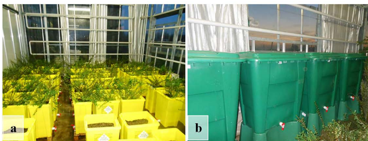
Figure 2. Photo of the greenhouse experiment at the University of Florence, Italy: (a) bioretention pot prototypes, (b) 200-L plastic water storage tanks.

70 plastic pot prototypes (Figure 1) with a truncated pyramid shape (418 x 310 mm, 347 x 245 mm base, and 575 mm height) with lateral taps at the bottom, were put in a greenhouse facility at the University of Florence in Sesto Fiorentino, Italy, in October 2013 (Figure 2).