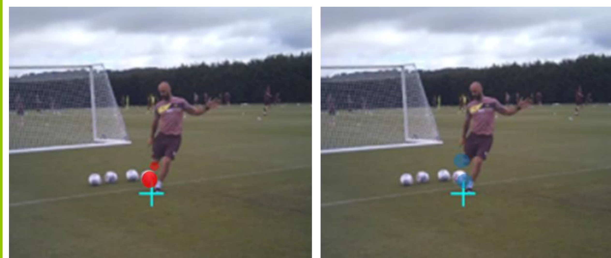
Figure 2: Mean fixation location and frequency, L=PK, R=DK. Small – Large circle = Low – High fixation frequency. Transparent – Opaque circle = Short – High fixation length.