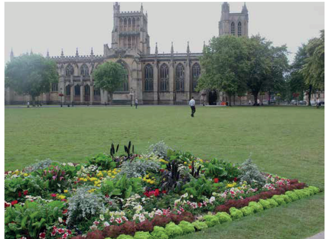
Vegetables for decoration at College Green, Bristol Cathedral