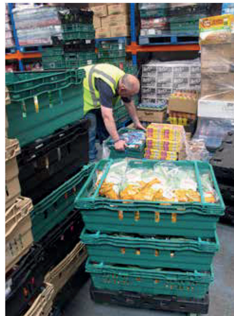
FareShare South West, Bristol, redistribution of surplus food to charities