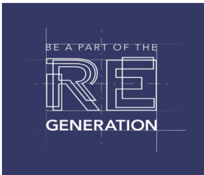
Figure 2 Branding created by final year graphics students

Waste streams from the textile industry have recently been addressed to support the 'I love my Clothes' WRAP campaign (2017). This recent partnership included the local Gloucestershire County Council Waste Team, Bristol Textile Recyclers (2017) and first year Fashion, Product and Interior Design students. The project has focused upon the notion of creating future scenarios for clothes, luminaires and furniture, using reclaimed textiles from the regional Bristol Textile Recycling Centre (2017). The Interior and Product Design students focused upon the design of 'a space within a space', luminaire and seating for the local Cheltenham Minster (2017) and the Wilson International Art Gallery (2017), as part of a product design Human Factors unit of assessment. Whereas, the Fashion Design students responded as part of their Ethical and Sustainable Design module. The expectation for each discipline's assignment was to creatively include the use of textile waste streams within their design solutions. The best designs of the three disciplines were given the opportunity to exhibit these designs as part of the launch of a newly established sustainable forum for textiles 'Thread Counts' on the 22nd April 2017: A fashion and textiles forum for sustainable and creative futures. Aiming to increase awareness of slow ethical textiles and sustainable fashion, while promoting it to a wider public audience regionally and contribute to developing a