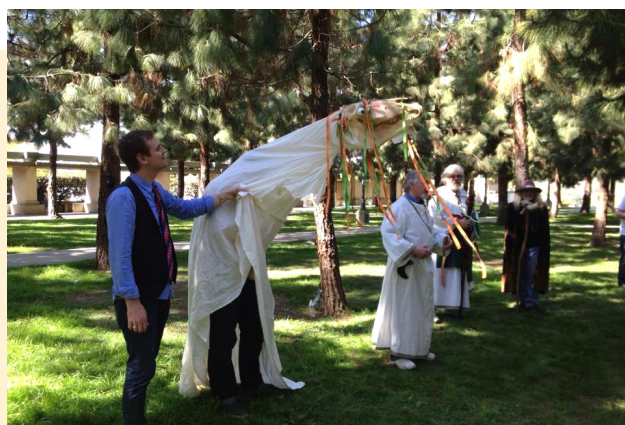
Plate 7 Los Angeles St. David's Day Festival, 2013

While a small number of examples, such as the Mari in Llangynwyd, Maesteg, can lay claim to a continuity of practice running for over a century, few others can do the same. The majority of Mari Lwyds practised today have a lineage that can be traced no more than thirty years, and of those, a significant proportion have emerged only in the last decade. It is suggested here that these are not examples of the traditional Mari Lwyd custom, but rather that they should instead be regarded as a distinct traditional form, which still represents legitimate intangible heritage.