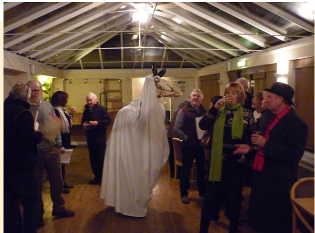
Plate 6 The first appearance of a new Mari Lwyd, 2017. Unusually, this example, rather than being tied to a specific location or community, was the work of an individual enthusiast. The loss of connection between the Mari Lwyd and a 'home' could mark another step in the evolution of the tradition.