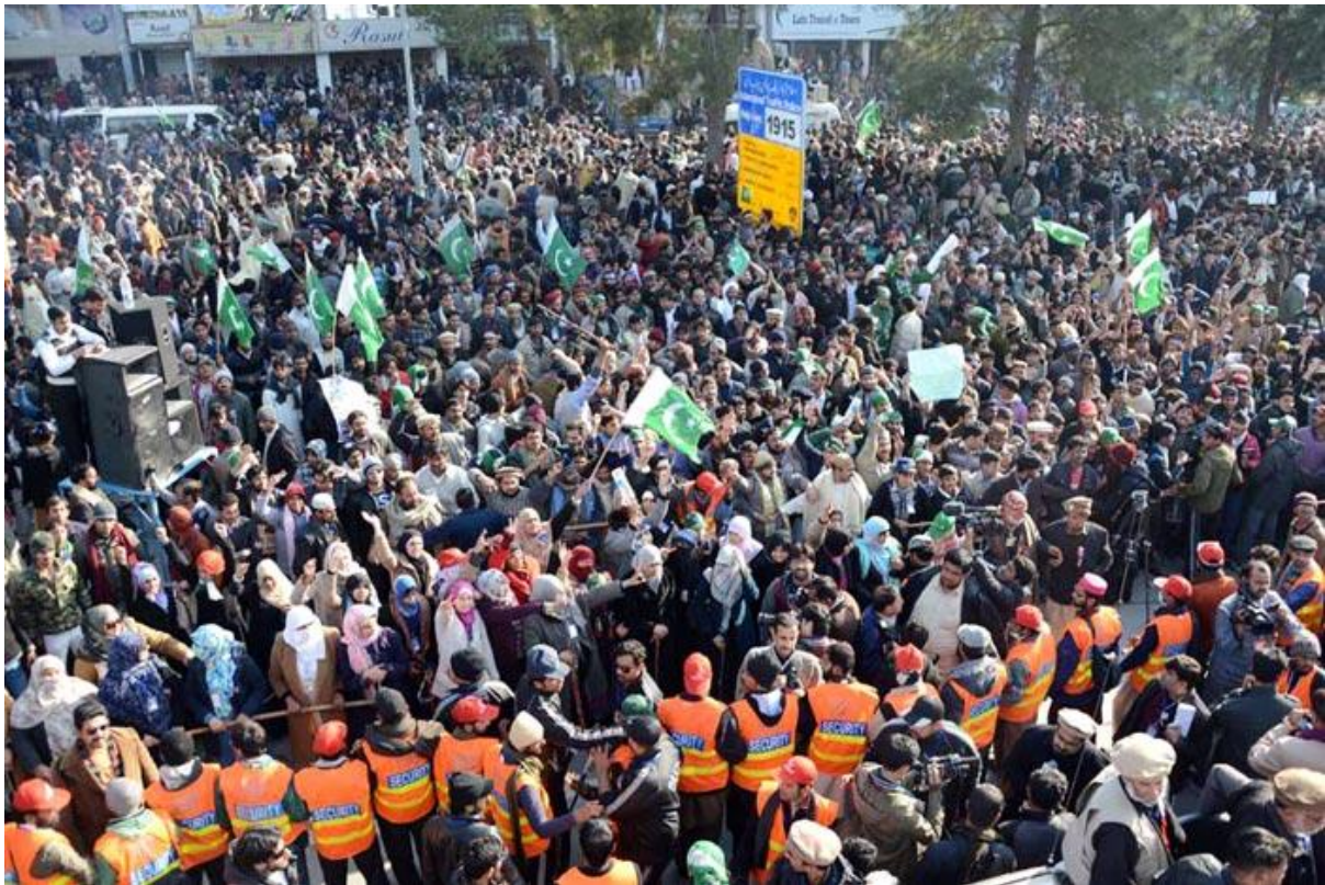
Appendix VI, MQ Political Mobilisation