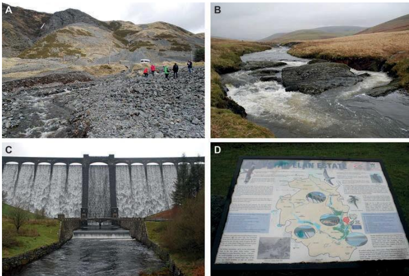
Cwmystwyth (photograph by Hywel Griffiths). (B) Bedrock outcrop above Craig Goch dam, the uppermost dam in the Cwm Elan dam complex (photograph by Hywel Griffiths). (C) Claerwen dam (photograph by Hywel Griffiths). (D) An example of an information board in Cwm Elan (photograph by Stephen Tooth). (Color figure available online.)

Gavin Goodwin’s and Hywel Griffiths’s poems engage directly with the impacts of mining and dam construction on the physical landscape. Goodwin’s eight evocative quatrains are strongly influenced by landforms and the processes operating on them. “We travel,” he says, “enclosed by ice-carved hills” and rocks that are “seemingly still” but the rivers are clearly polluted with “poison” and “swimming with copper and lead.” Standing near a bedrock outcrop over which the natural course of the River Elan flows before being dammed (Figure 2B), he sees the natural geomorphological processes—the “eddy and swirl of pebbles slowly/burrow down into the bedrock . . . with ever-refreshing force.” There are human stories as well: The lead miners of Cwmystwyth are here, for example (“by thirty three those men were dead”), as are the laborers who built the dams in Cwm Elan, backs bent by years of building work (“Measure that