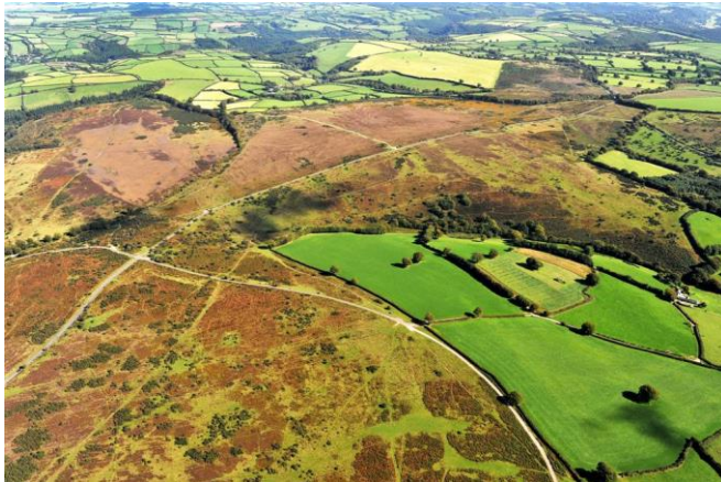
Figure 2 – landscape zoning: Winsford Hill, Exmoor

Taken together, these influences create a gradual, but visually apparent, zoning of a landscape, which was hitherto functionally integrated and visually coherent. 'Conservation management' under agri-environment schemes, applied piecemeal at a field-by-field scale, was thus contributing to ultimately destructive change at the landscape scale, weakening its spatial coherence, its overall functionality and its cultural value (figure 2).