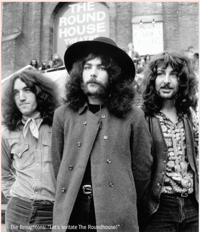
The Broughtons: "Let's levitate The Roundhouse!"