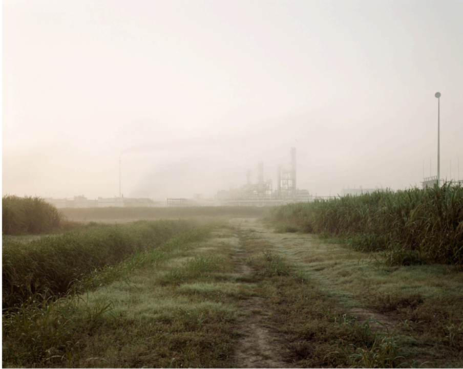
Figure 2. Sugar Cane and Refinery, Mississippi River Corridor, Louisiana, 1998 , from Petrochemical America (Aperture 2012) © Richard Misrach, courtesy of Pace/MacGill Gallery, New York; Fraenkel Gallery, San Francisco; and Marc Selwyn Gallery, Los Angeles

strongly hinted at in his work, such as in Figure 2, where sugar cane, a crop dependent upon petrochemicals, and the petrochemical processing plant itself exist side by side. Orff extends these observations in her work, making explicit the ways in which oil is fundamental to American notions of identity, such as in Figure 3. Here she makes explicit American ideas about the right to space, the suburban dream, and the wholesale consumption of goods and processed food, in order to illustrate the dependence on the petrochemical industries that underpins American life.