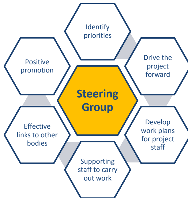
Figure 1.2.1 Role of Steering Group

Three projects from the South West upland areas were approved by SWRDA and started operating in the autumn of 2009 under the South West Uplands Initiative (SWUI). They were the: