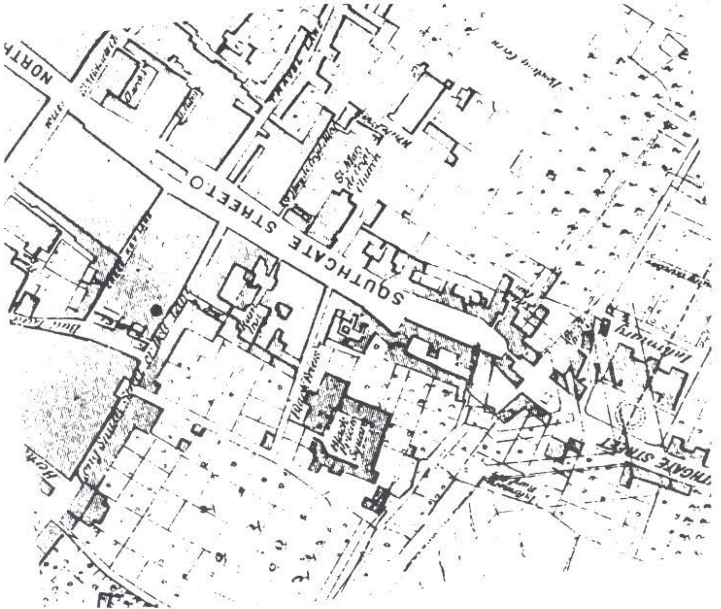
A plan of the City of Gloucester surveyed and delineated 1780, by R. Hall and T. Pinnell by kind permission of Gloucestershire Collection, Gloucester Library.

unemployment and 'many businesses...closed'. 48 If trade from the docks was so drastically affected, then it seems likely that businesses close by, especially non-essential ones such as chronometer purveyors, might also lose trade as local people restricted their spending accordingly to the economic climate. These events do warrant