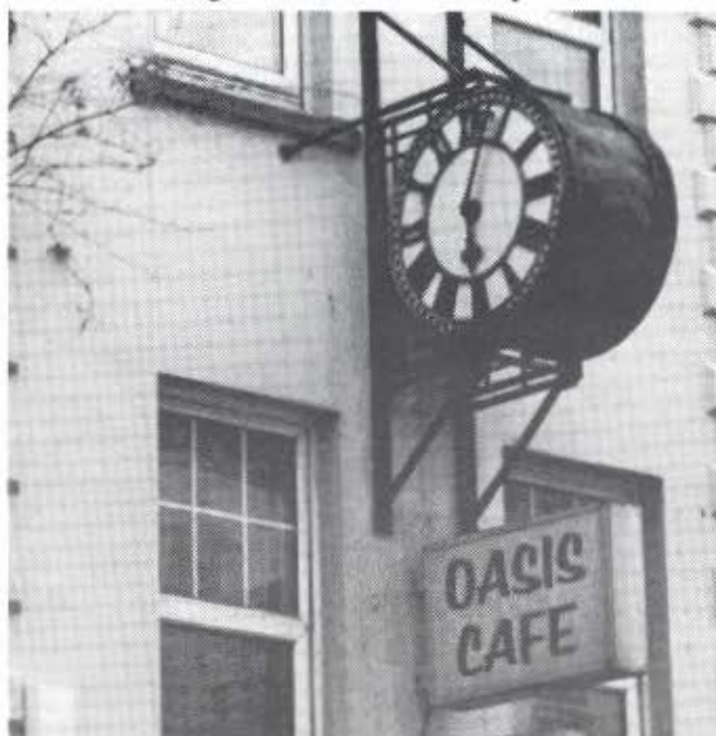
The clock over Oasis Café at No. 59 Southgate Street

located. According to Dowler, one Edmund Simpson occupied No.122 Southgate Street from 1867 until 1885. 54 Using Done's plan, it was quickly established that this site is now No.59, occupied by the Oasis Café. It was noted with interest that on the front face of the building at first floor height, a somewhat dilapidated double