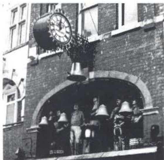
Niehus Brothers clock

Whether the clock was ever constructed is not known, but close by on the junction of Southgate Street and Eastgate Street, the Saxon church of St. Michael incorporated a clock from at least 1546. Records for that year reveal that the sum of eight shillings was paid as the annual remuneration for its maintenance. 12 Furthermore, it was in St.