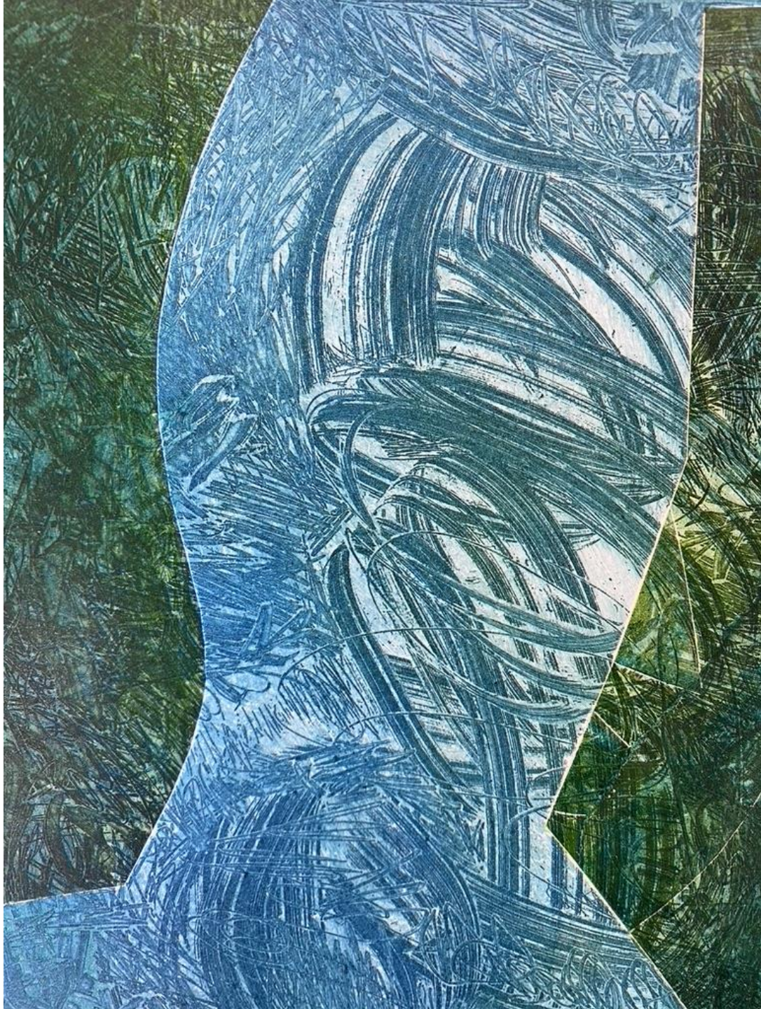
Makers' Space, The Wilson Museum and Gallery, 2023