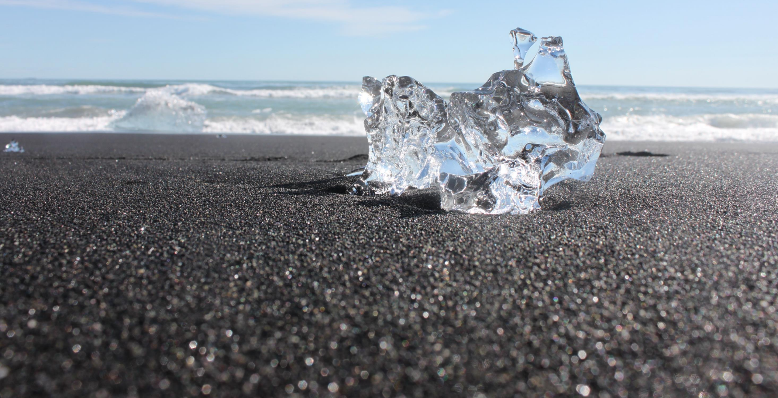
Field work, Jökulsarlon Iceland