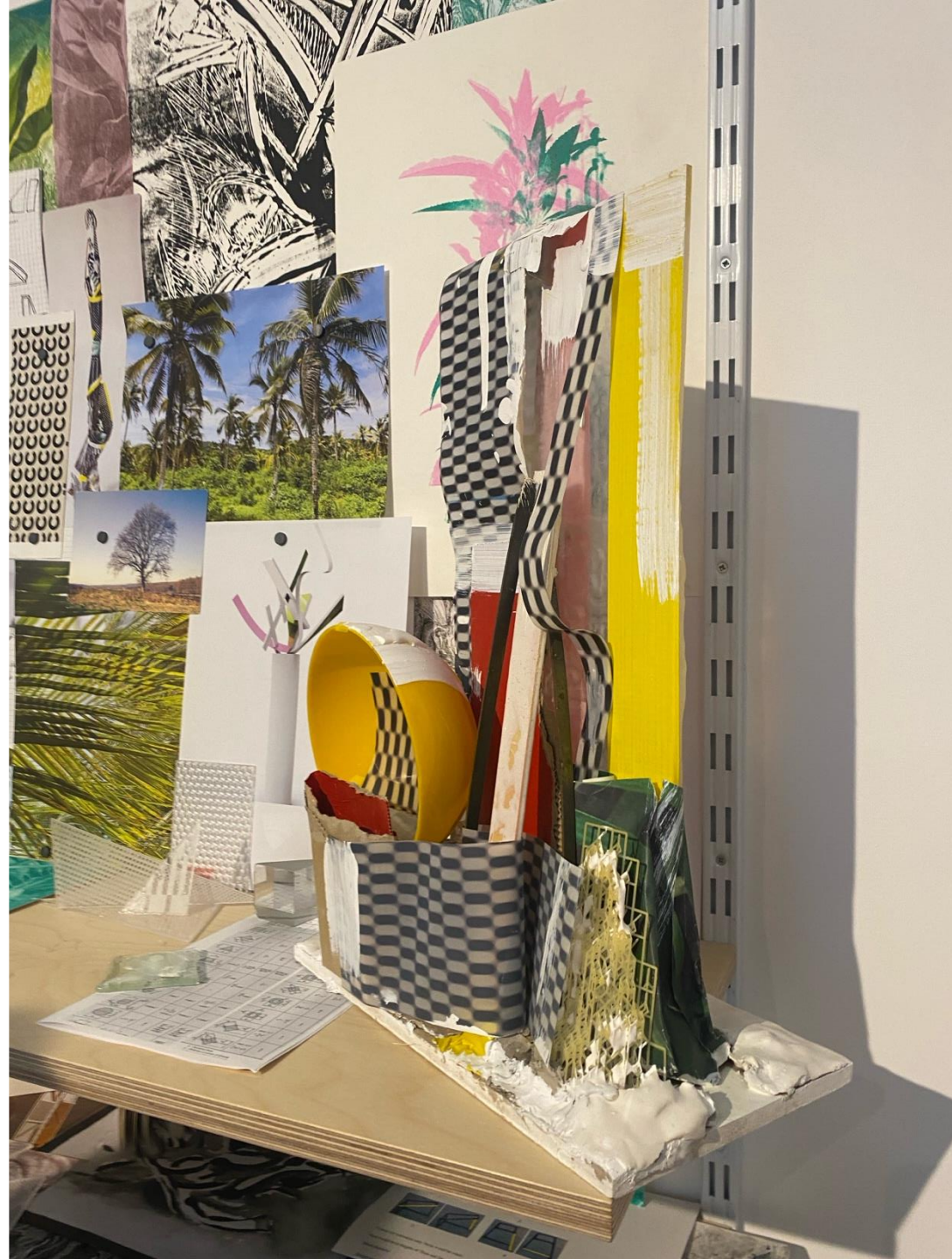
Makers' Space, The Wilson Museum and Gallery, 2023