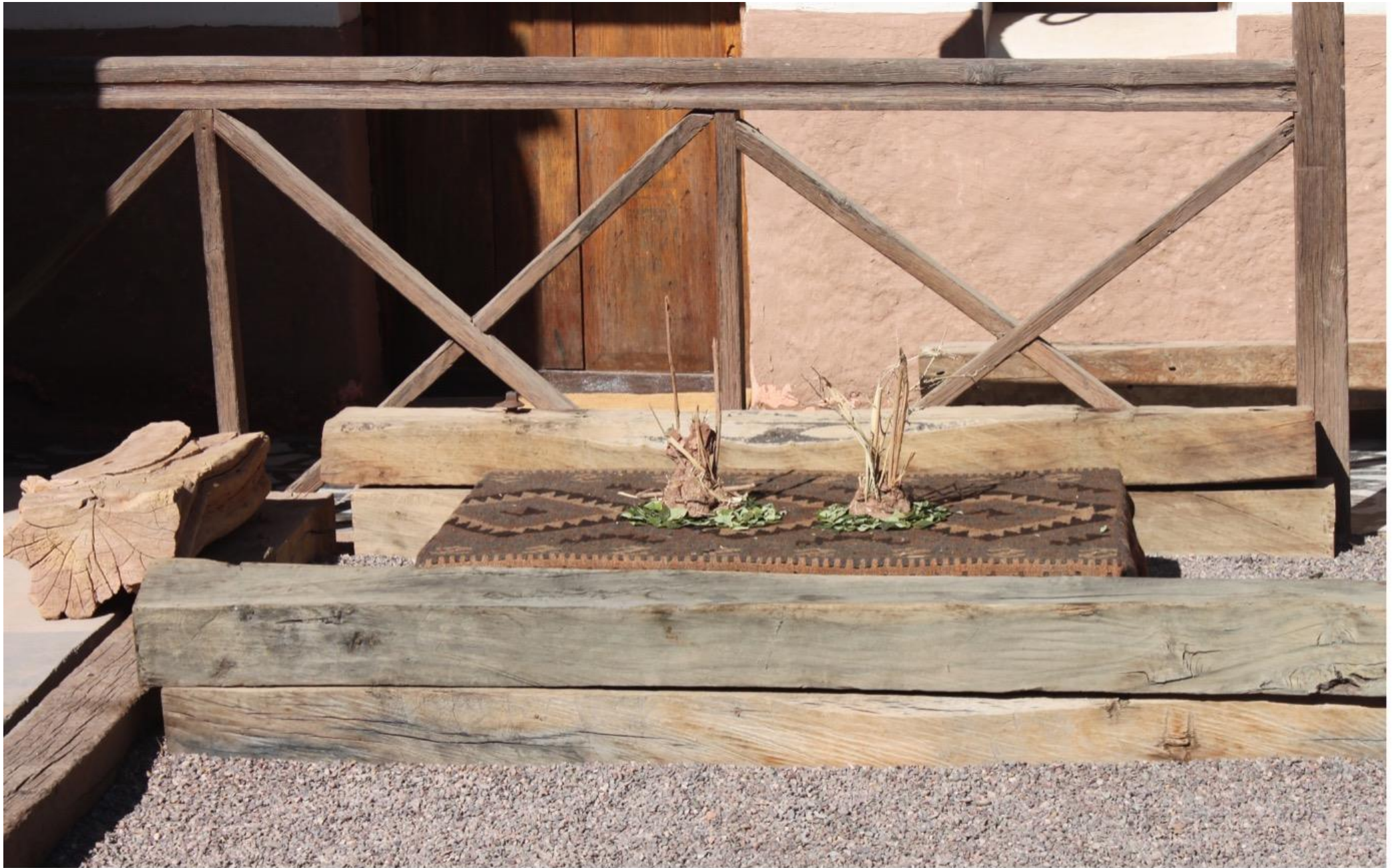
Embodied Land, unfired river clay, straw, found branches, dimensions variable, Chile, 2023