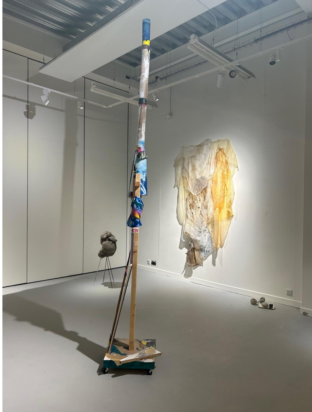
Fabricate, Hardwick Gallery, 2023