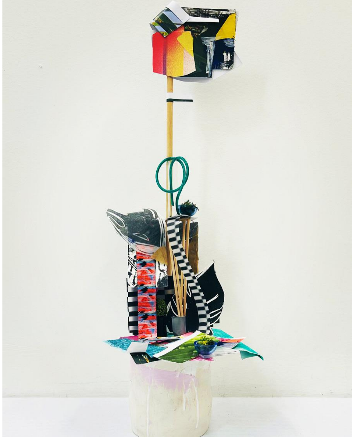
Armila I, Mixed Media, 2023