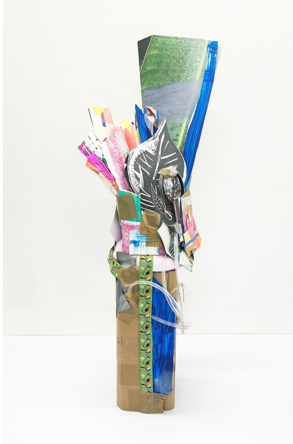
Armila II, Mixed Media, 2023