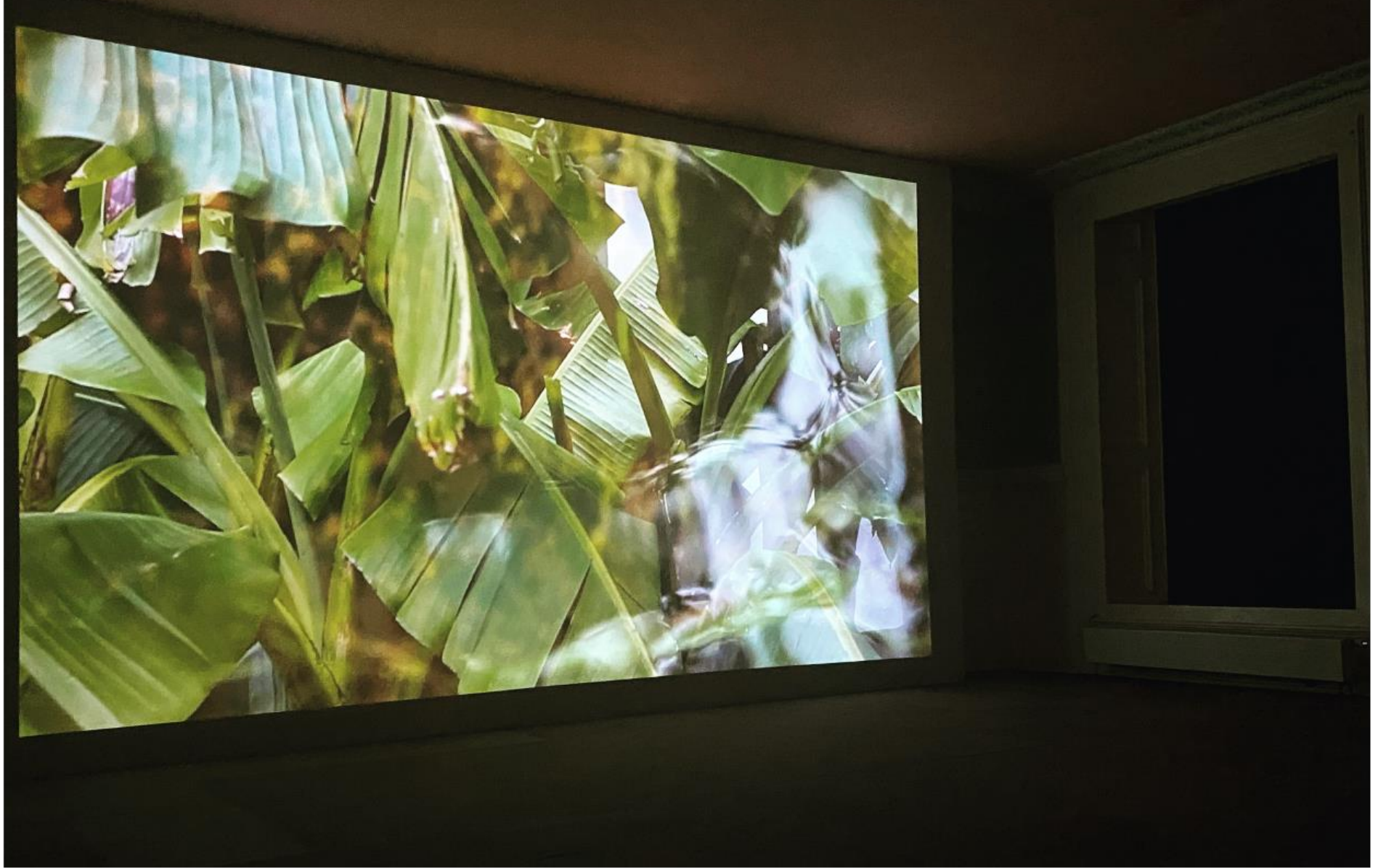
Waiting for the Natural to be Turned On Digital Projection 2021