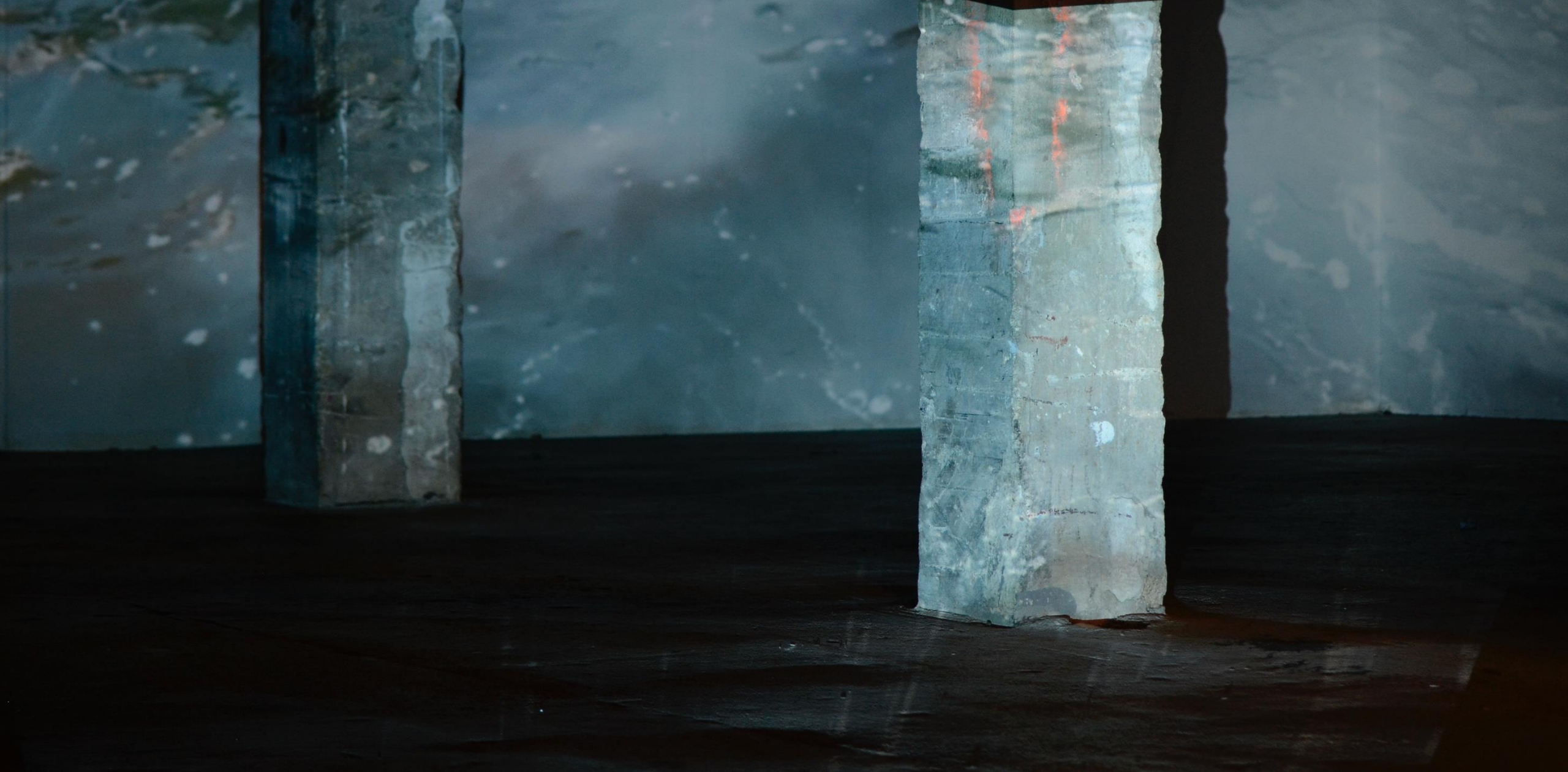
On Light: Water: Air 2018 Light Projection