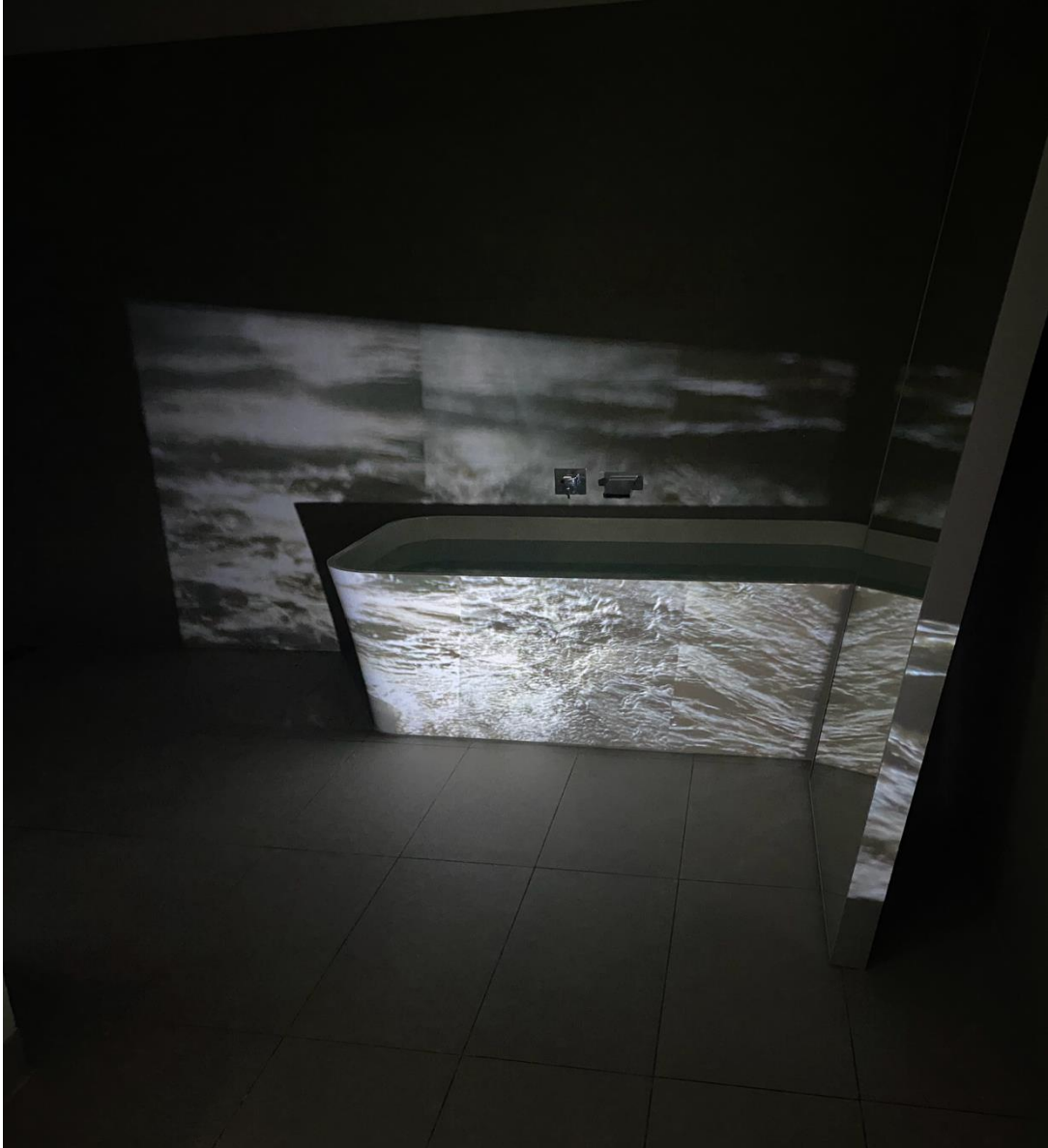
Connecting Through Water 2021 Light Projection Created for Plus One in Hoxton, London.