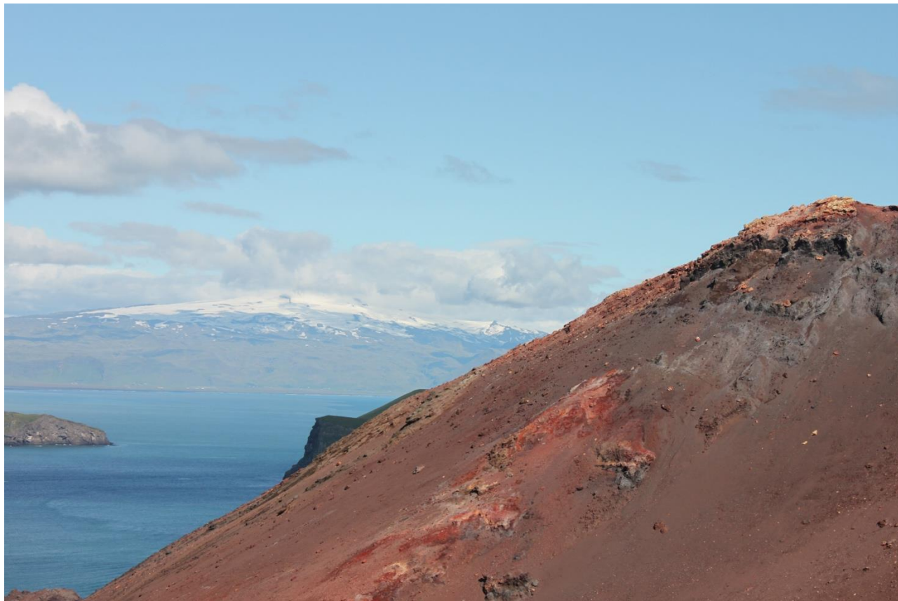
Field work, Eldfell Volcano, Heimaey Iceland