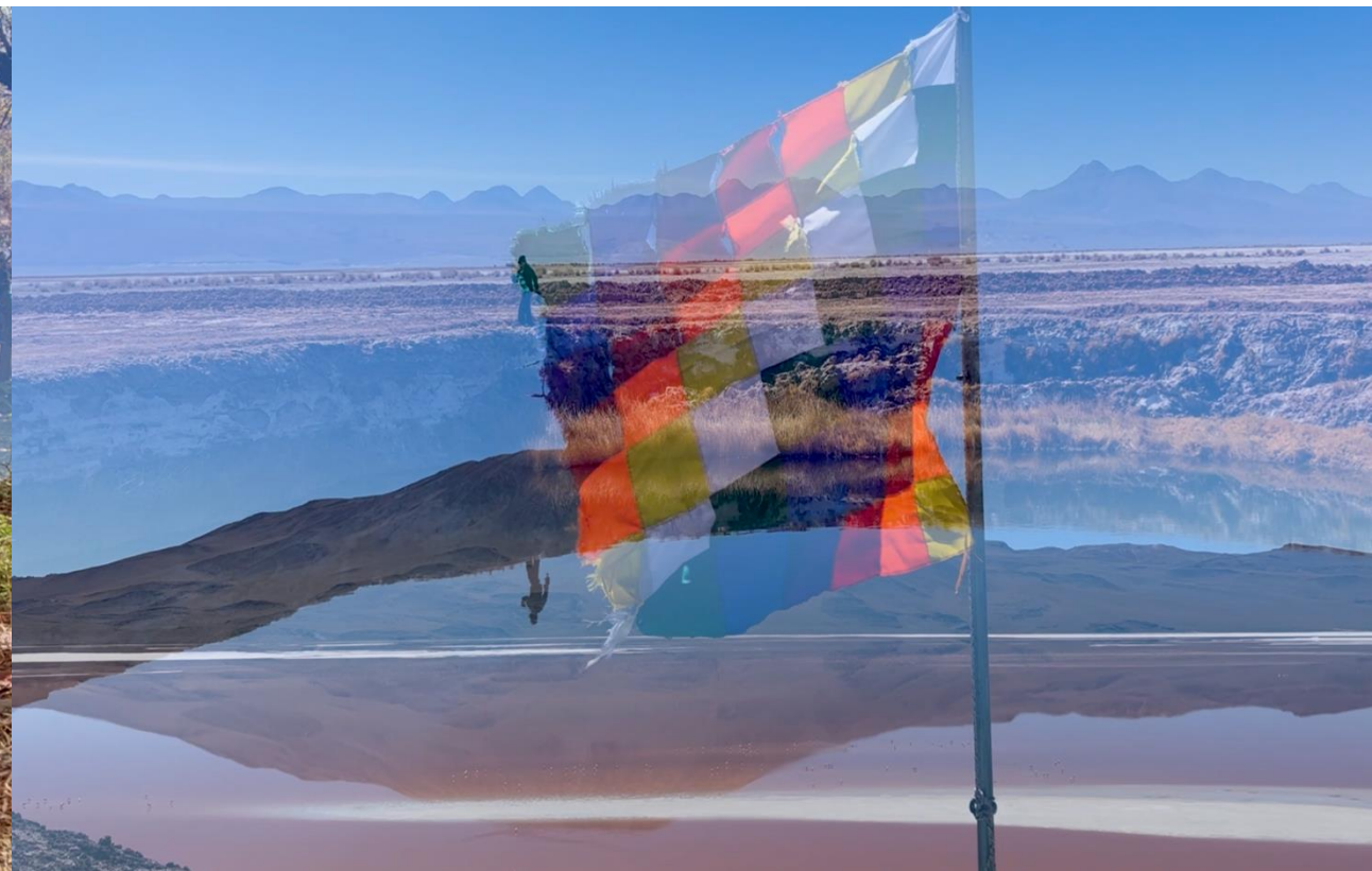
Stills from Ayni , Single Channel moving Image, 2024