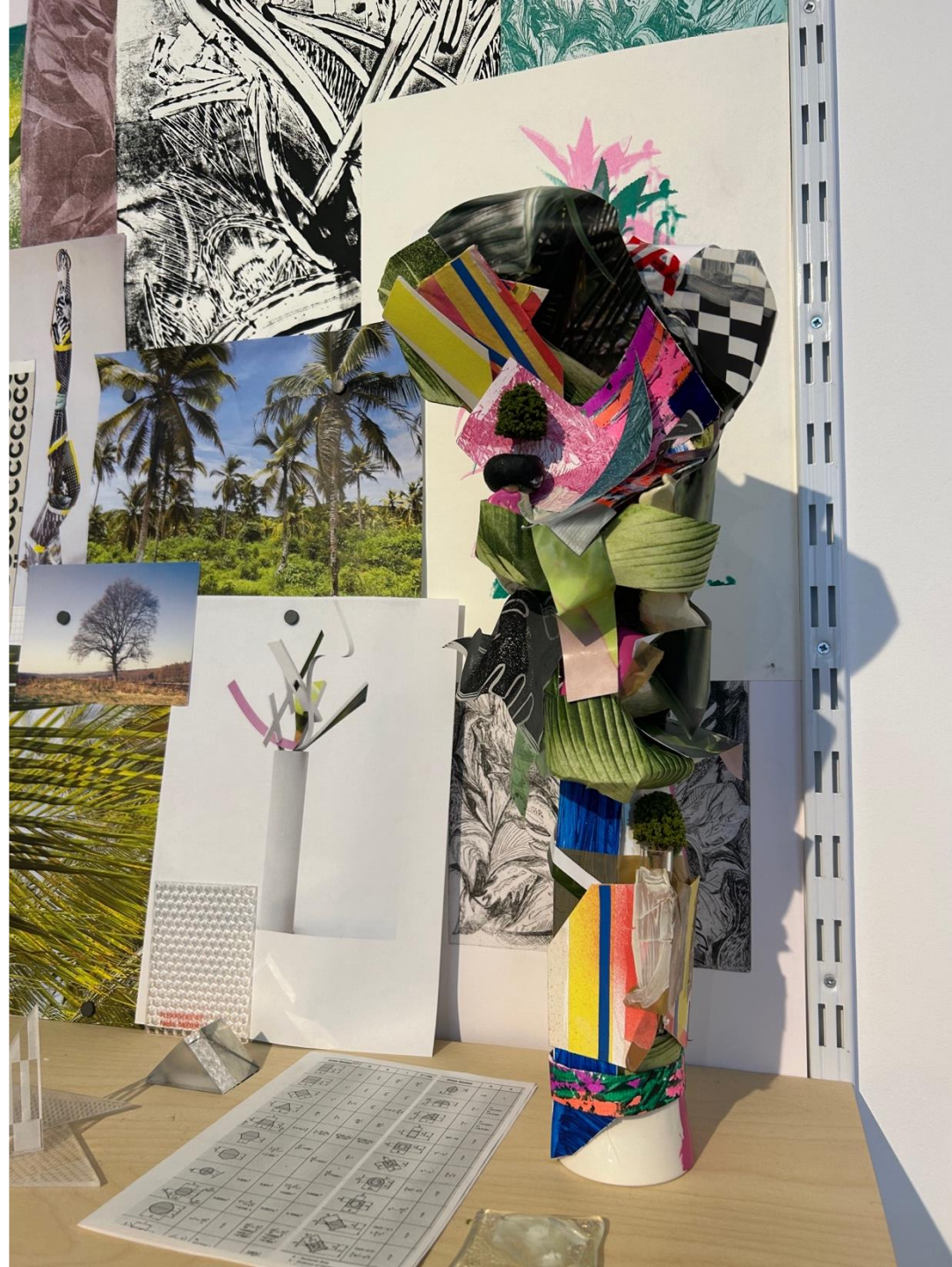
Makers' Space, The Wilson Museum and Gallery, 2023