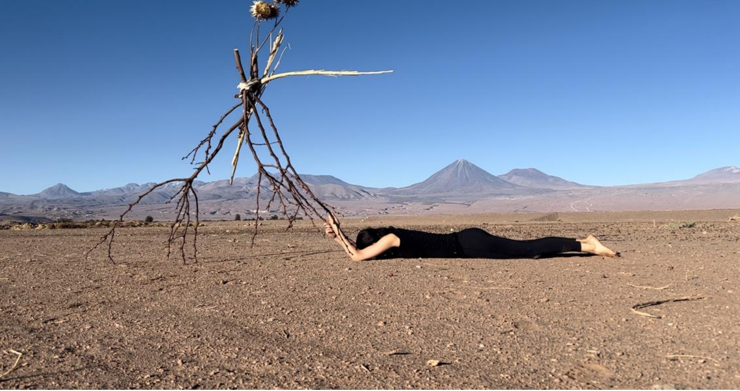
Finding Water, Performance Stills, Chile, 2023