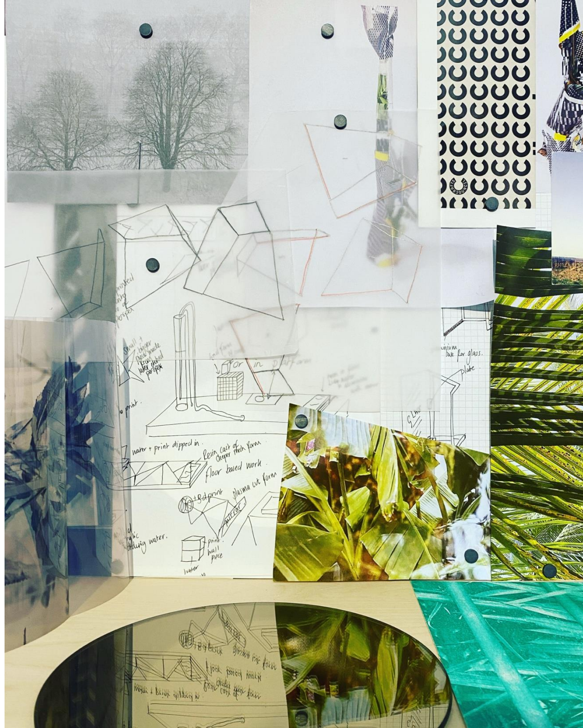
Makers' Space, The Wilson Museum and Gallery, 2023