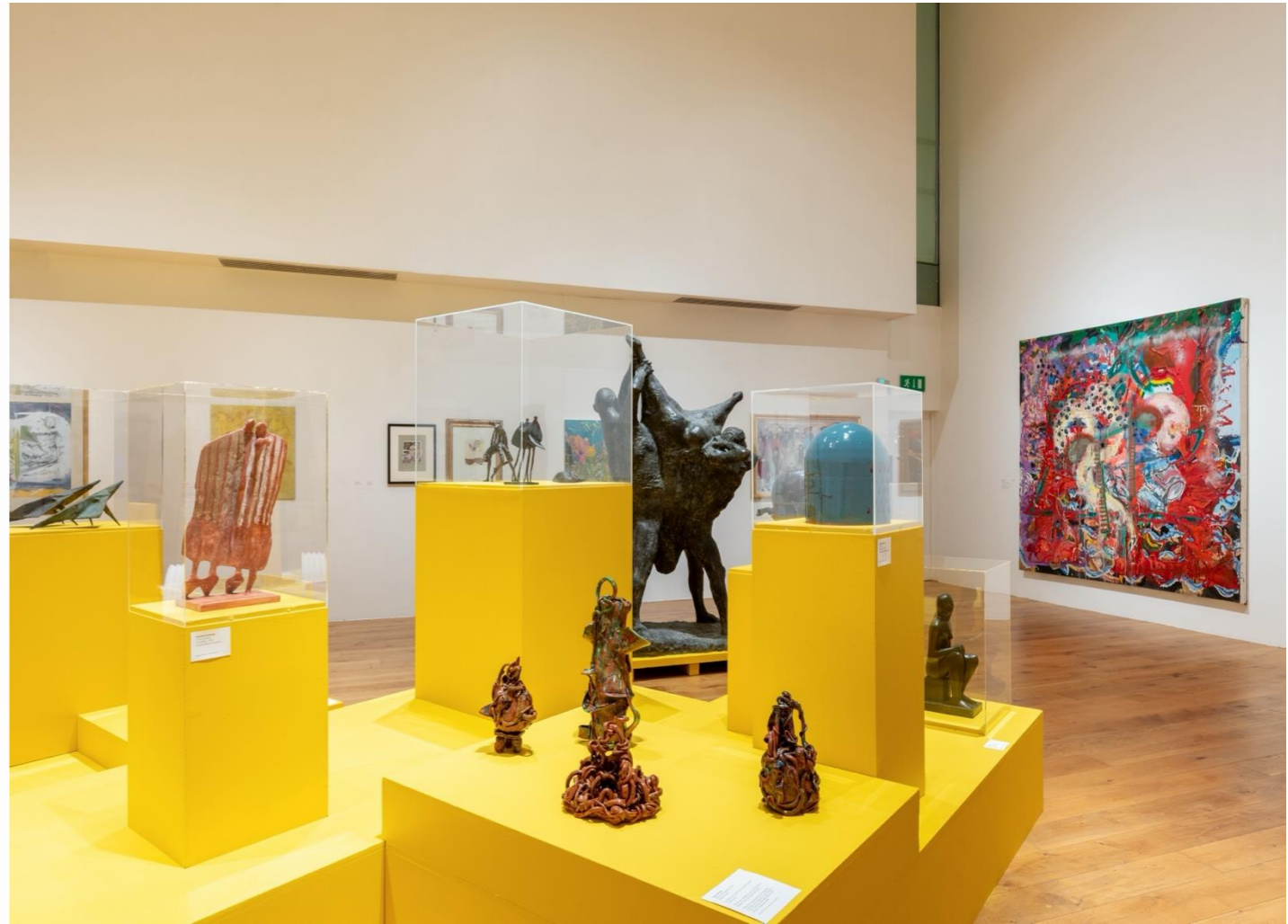
Snakes and Ladders, Glazed ceramics, The Lightbox 2024