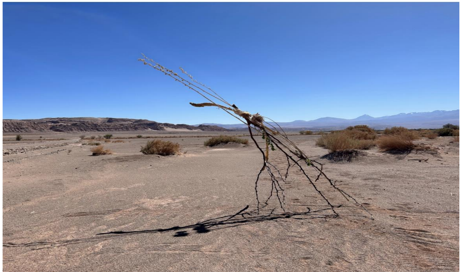
Finding Water, Desert Plants, Fabric and String. Dimensions Variable, 2023