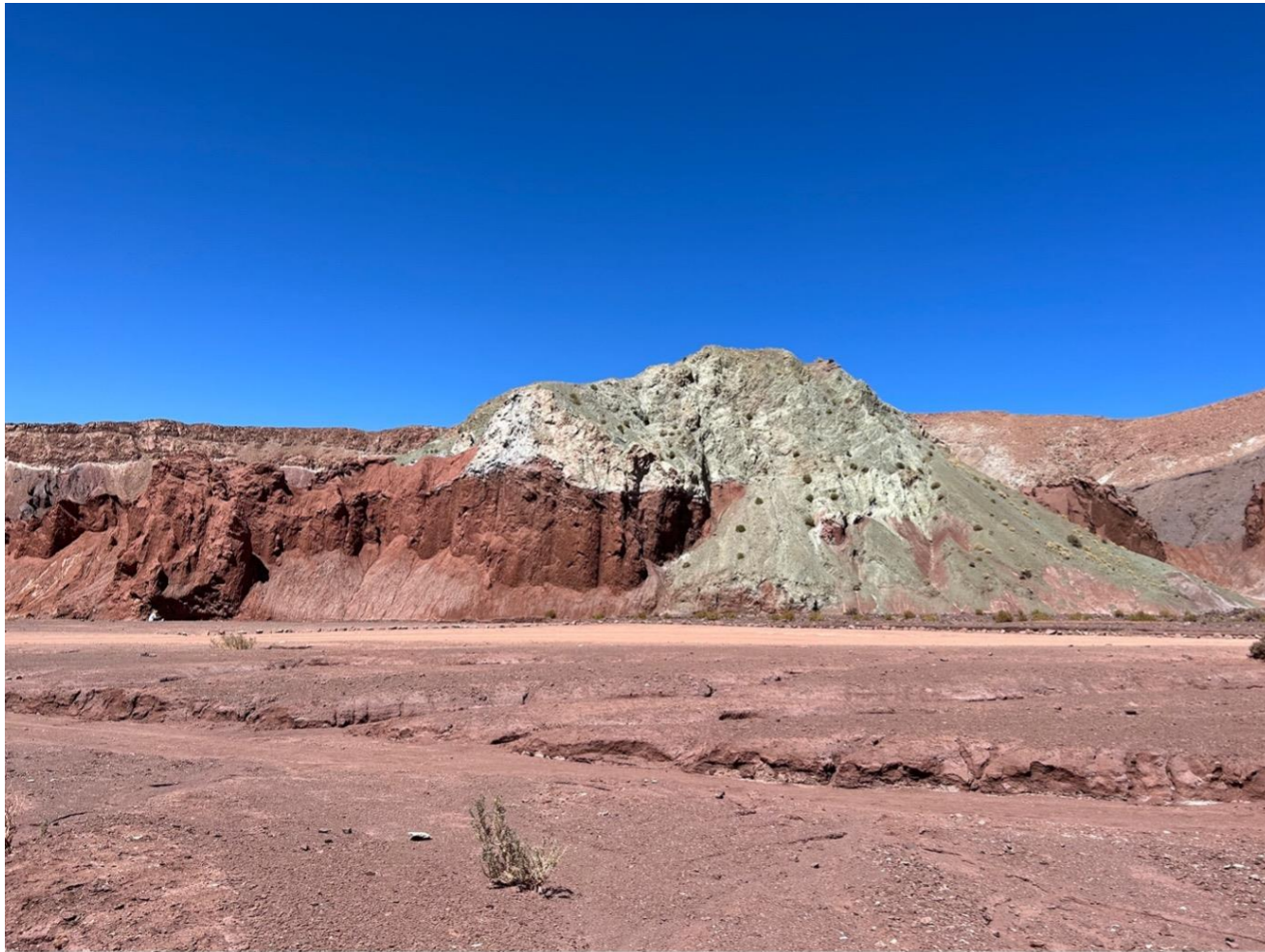
Valle Acoiris, Chile. (Rainbow Valley)