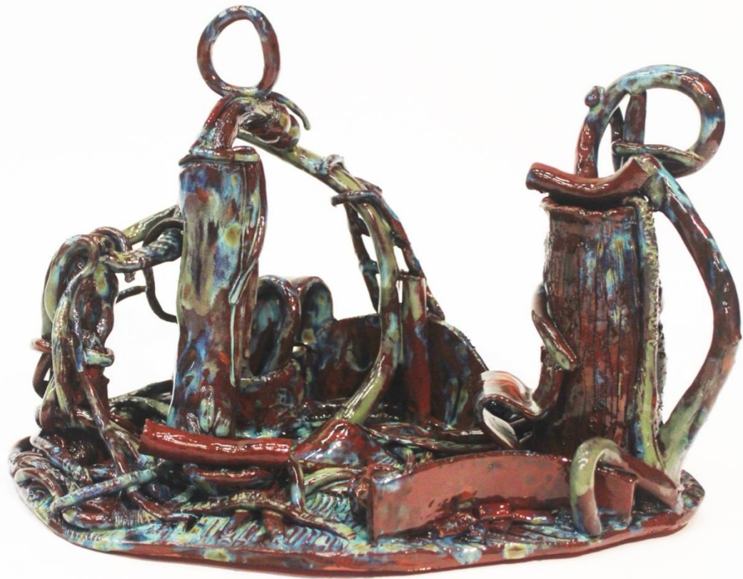
Crystal World, Glazed Ceramic, 40 x 30 x 20 cm 2024