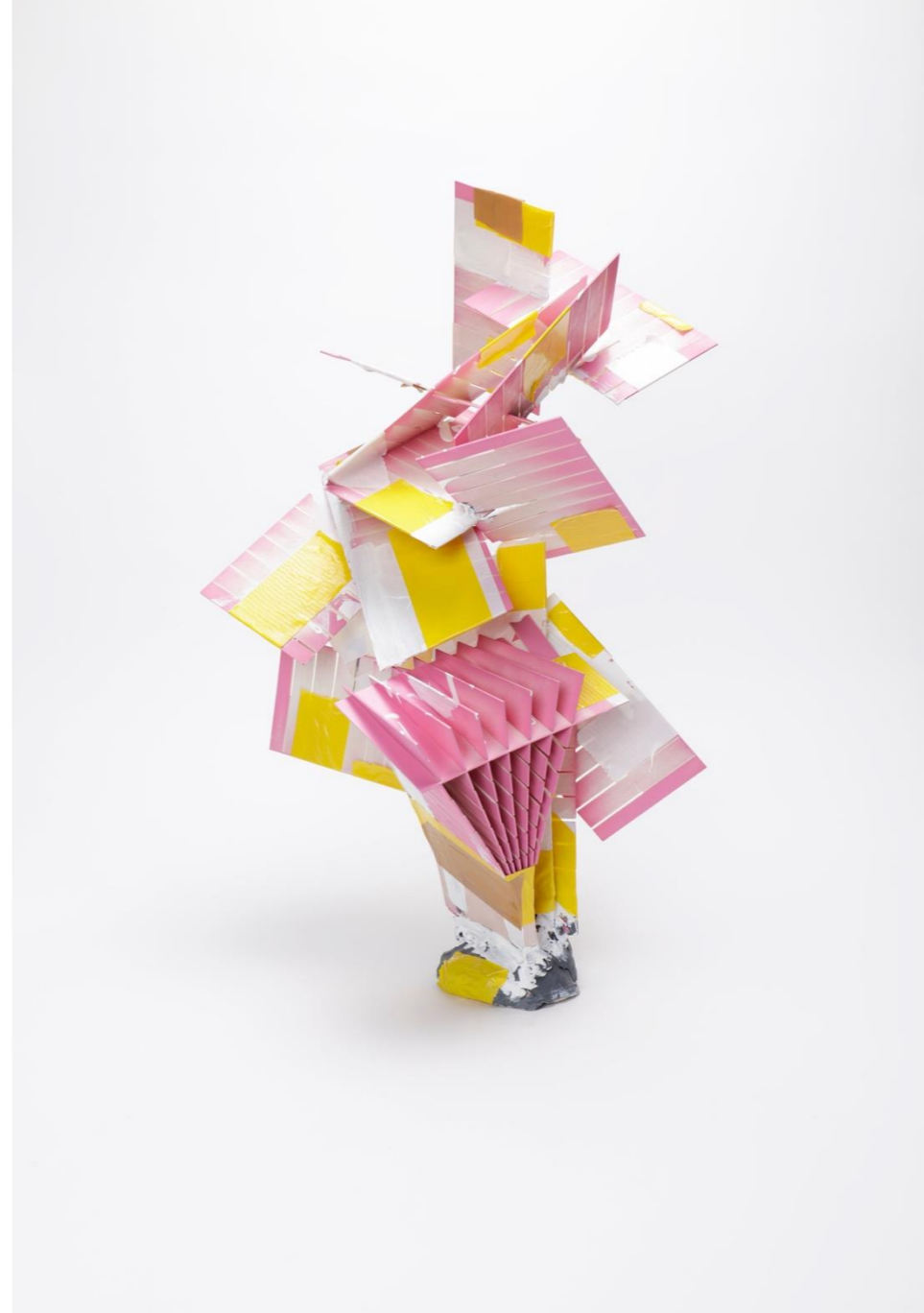
Chain Reaction, Mixed Media, 2019