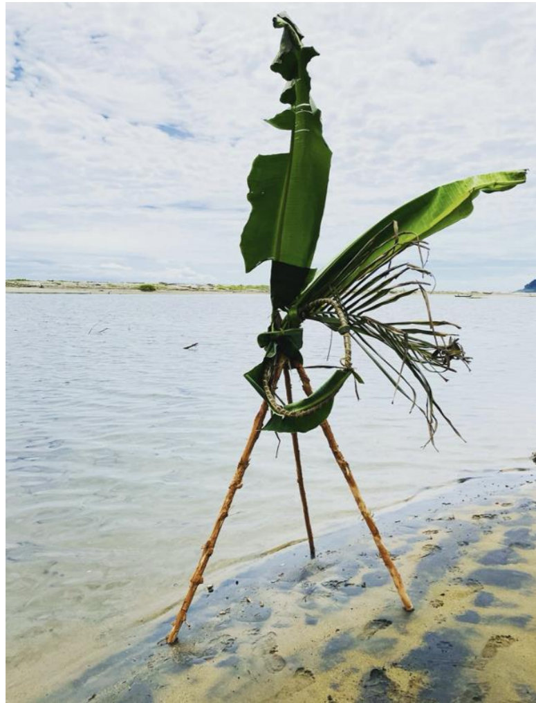
Hope , found natural materials, dimensions variable, Panama, 2022.