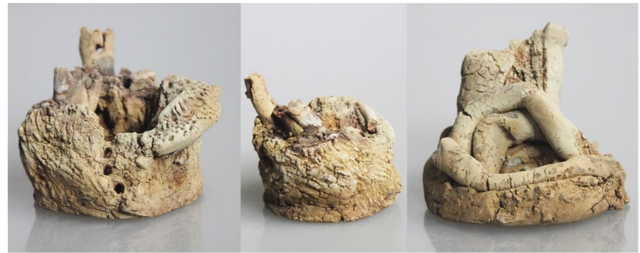
Volcan , Glazed ceramics using copper and salt fired in llama dung fuel fire pit, dimensions variable, Chile 2023