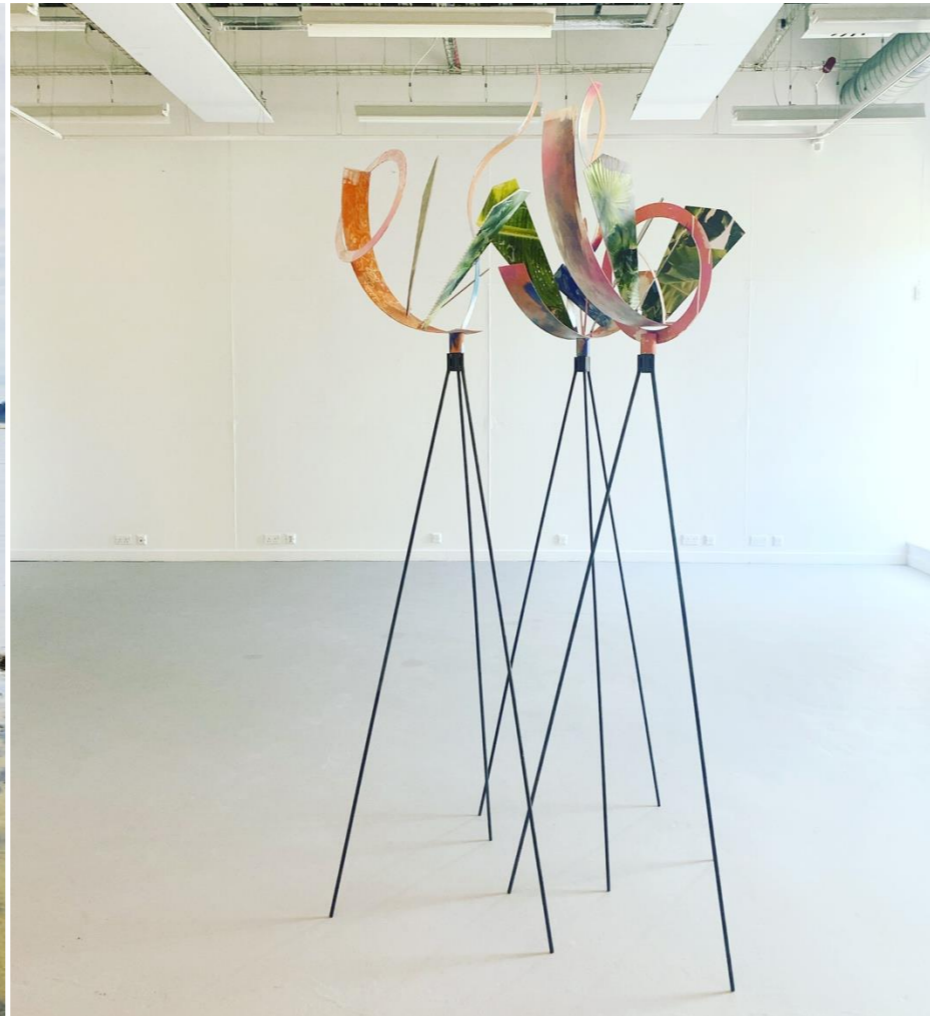
It's Going to Be Okay , Reclaimed steel and aluminium, metal paint, reclaimed interior paint and digital print onto reclaimed plastic. 2022