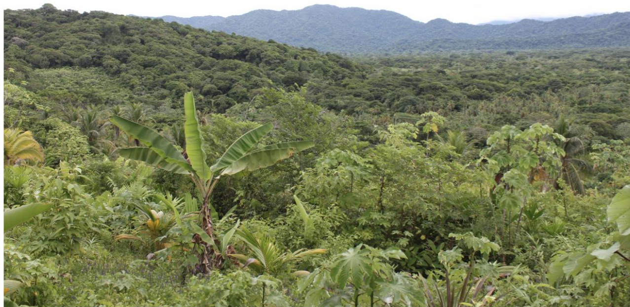
Darién Gap, Armila, Panama, 2022