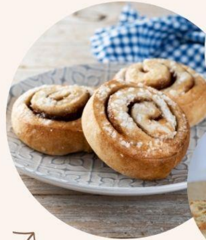
KANELBULLE (CINNAMON BUN)