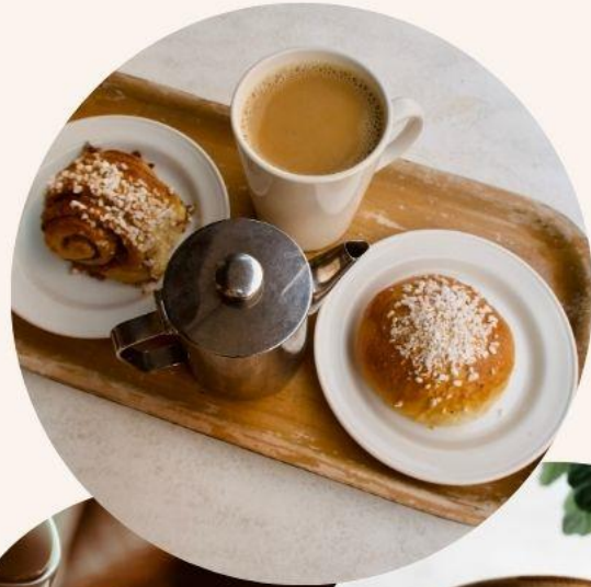
ATT FIKA (HAVING A COFFEE/-BREAK)