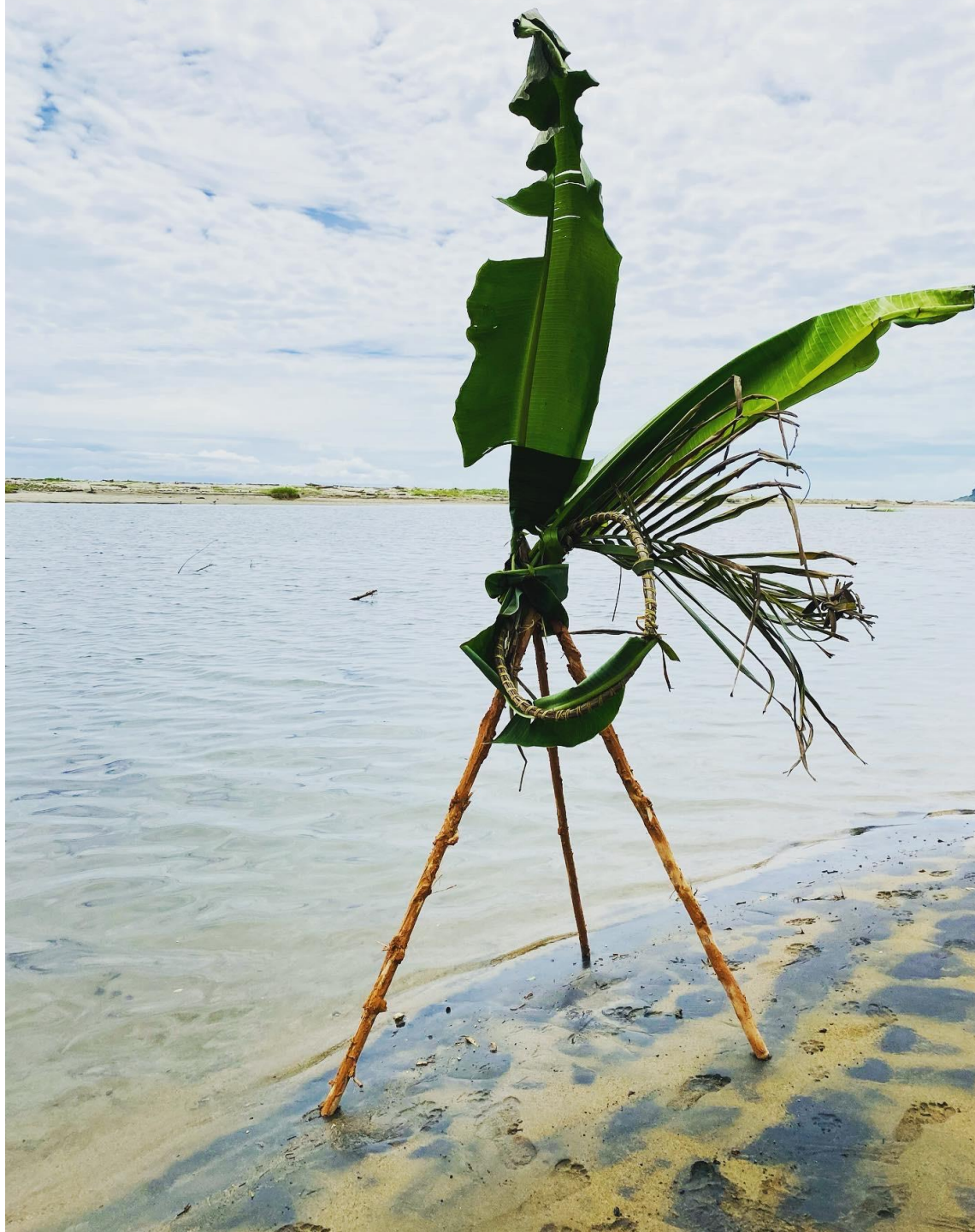
Hope 2022 Mixed media Armila, Panama