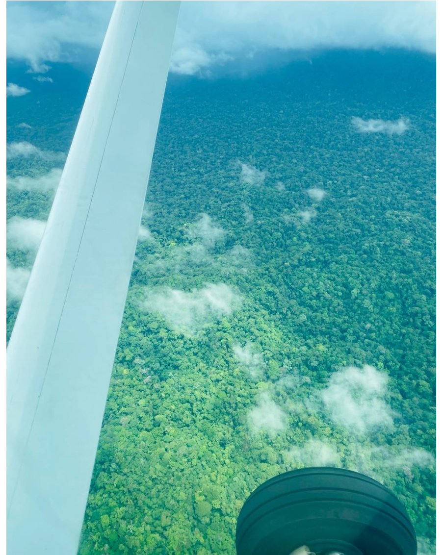
Armila, Panama. The Darién Gap with thanks to the Guna People and La Wayaka Current