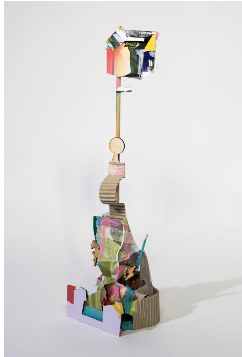
Your Place and Mine Susie Olczak Mixed media on reclaimed banana crate 50 x 30 x 25 cm 2024

Reclaimed natural materials Made in Armila, Panama 2022