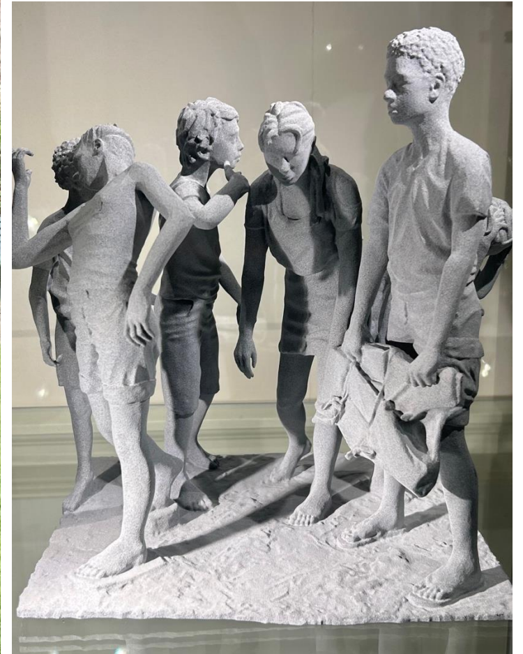
The Children of Calais Ian Wolter 3D printed Model 315 x 262 x 302 mm 2024