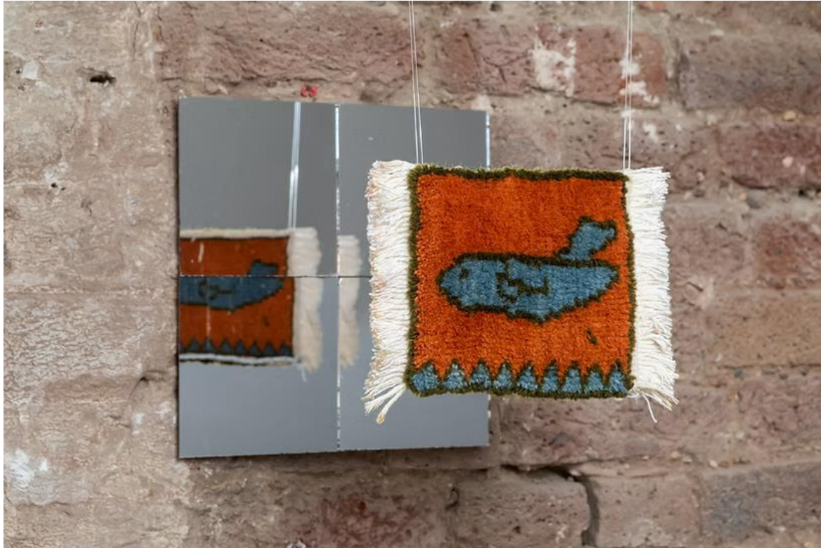
Afghan War Rugs Reimagined