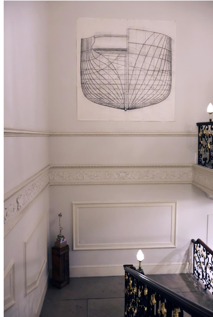
Unfolding Vessels; Scaling Series Sarah Duyshart Charcoal on Paper 2.26m x 2.26m 2023