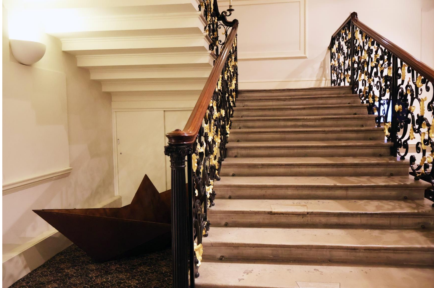
Thames Samuel Zealey Steel 2600 x 860 x 1000 cm 2023