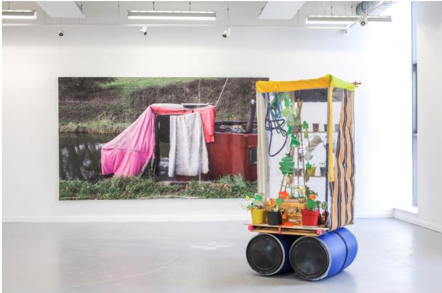
Greenhouse Raft 2019 Marine canvas, awning fabric, storage barrels, wood scraps, metal poles (various), clothes rail, zips, seat belt, pots, bottles, bamboo, herbs, beetroot, paracord, string, bag-for-life, fermenting bananas, glass jar, pegs, trowel, air-dry clay, paper, wire, wool, hose, hooks, crate, jug, fold-out chair, ratchet straps, gardening materials, tape, photographic prints (cut and sculpted), squash.