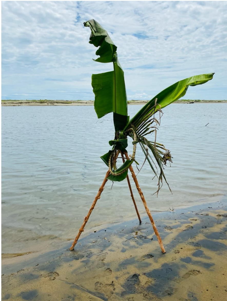
Hope Susie Olczak

Reclaimed natural materials Made in Armila, Panama 2022