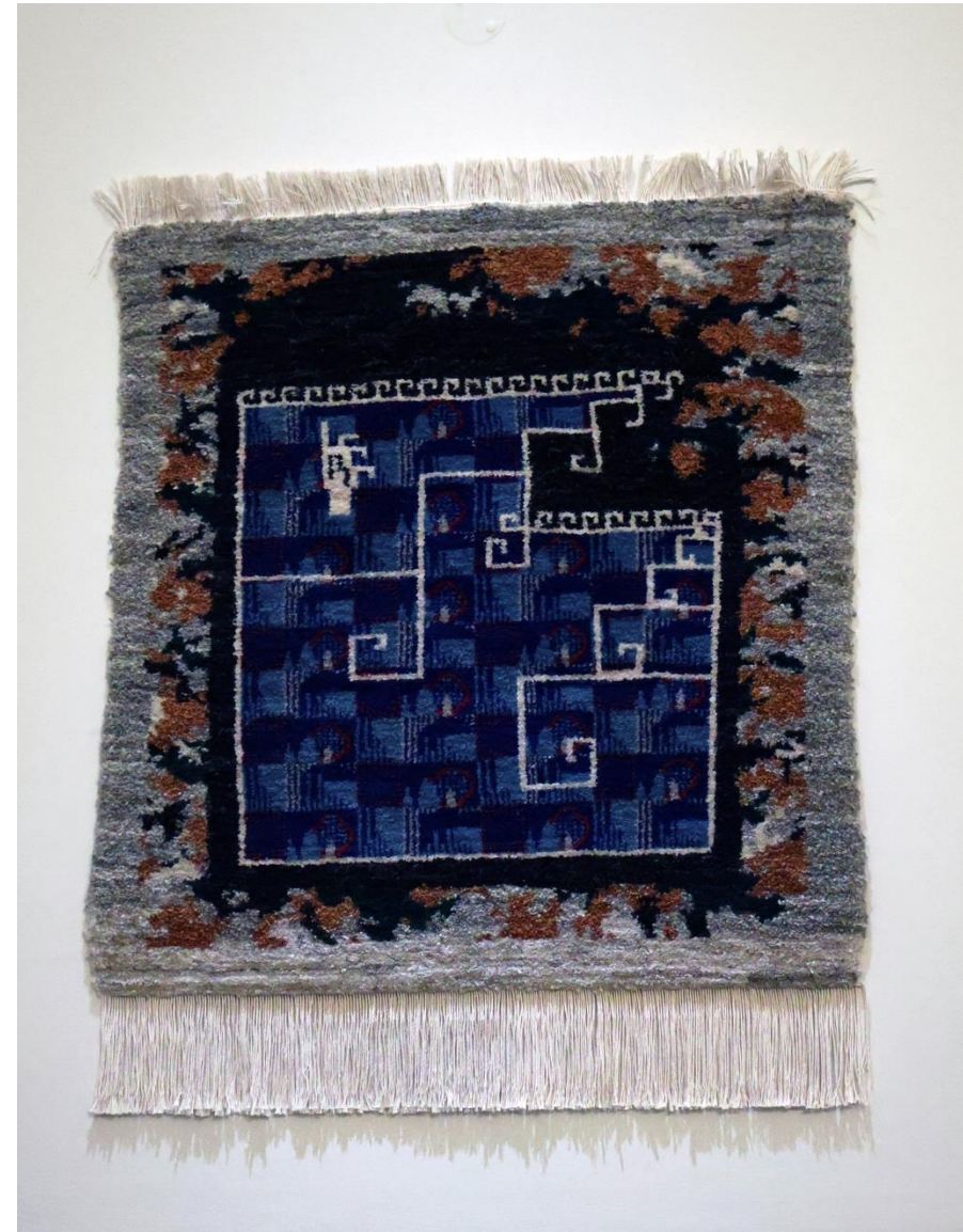
Water Safer Than Land Ghafar Tajmohammad Hand woven ghiordes knotted pile rug, natural dyed Afghan Ghazni wool, and British synthetic dyed wool, cotton warp and yarn. 800mm x 1200mm 2024