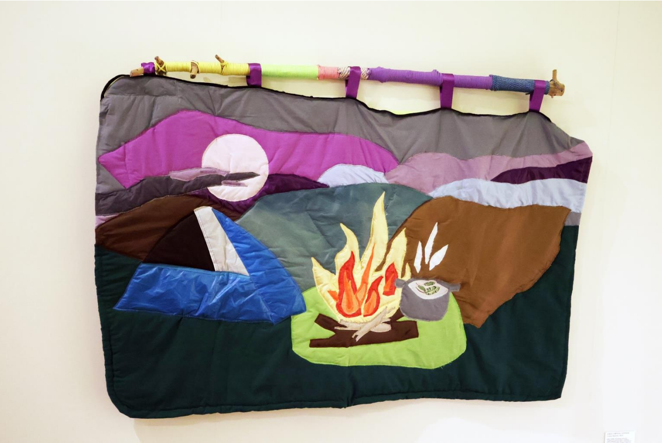
Camp Banner Anna Chrystal Stephens Mixed textiles- repurposed domestic, camping and survival fabrics. Applique quilting (sleeping bag effect) suspended on found wooden baton covered in paracord. 200cm x 120cm 2023