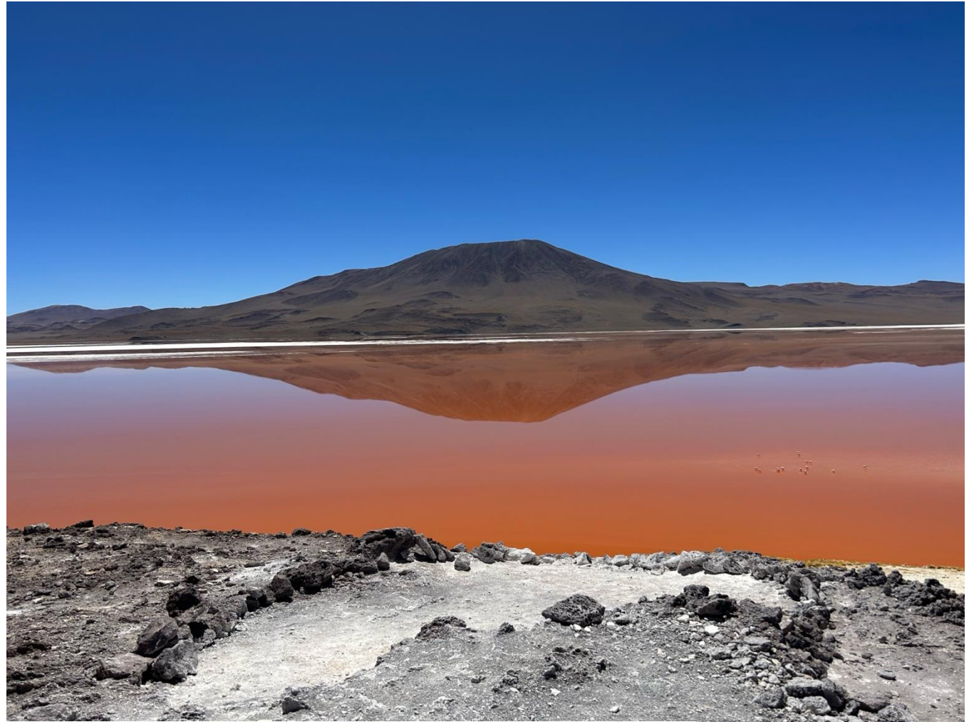
Laguna Colorada, Bolivia ; 1.5 m (4 ft 11 in) · 35 km (22 mi) · 4,278 m (14,035 ft).