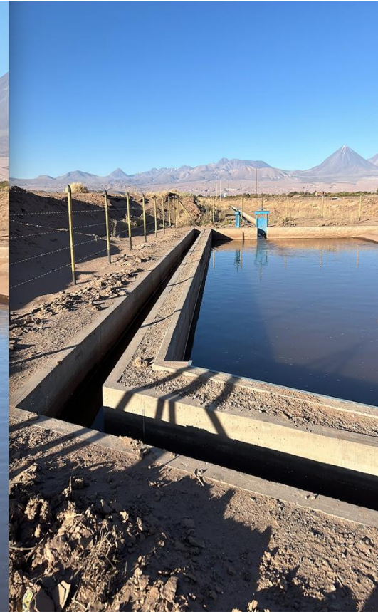
Pipes in Armila Panama and Terracing and irrigation in Coyo, Atacama, Chile