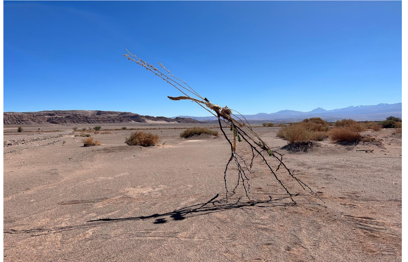
Finding Water. 2023 Desert Plants, Fabric and String Dimensions variable Coyo, Chile