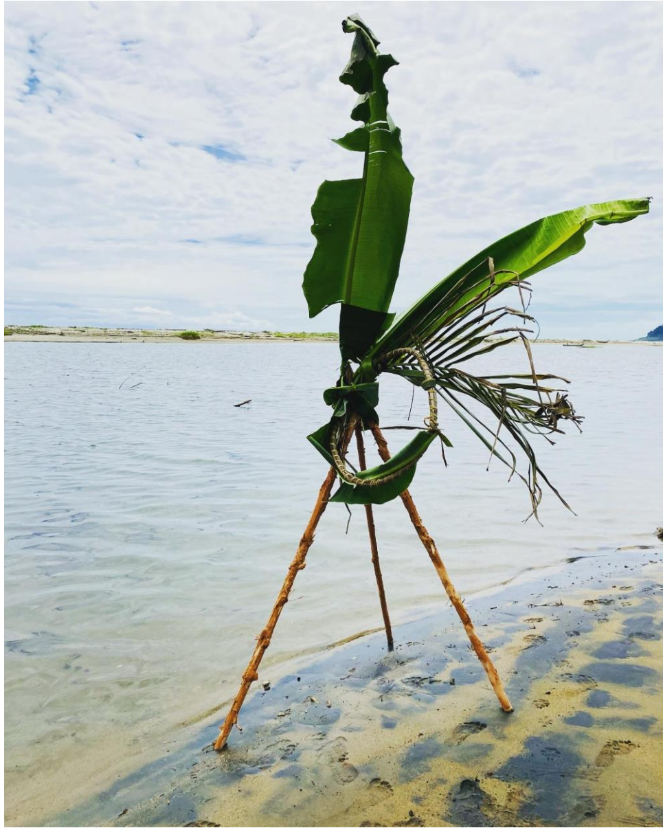
Hope 2022 Mixed media Armila, Panama