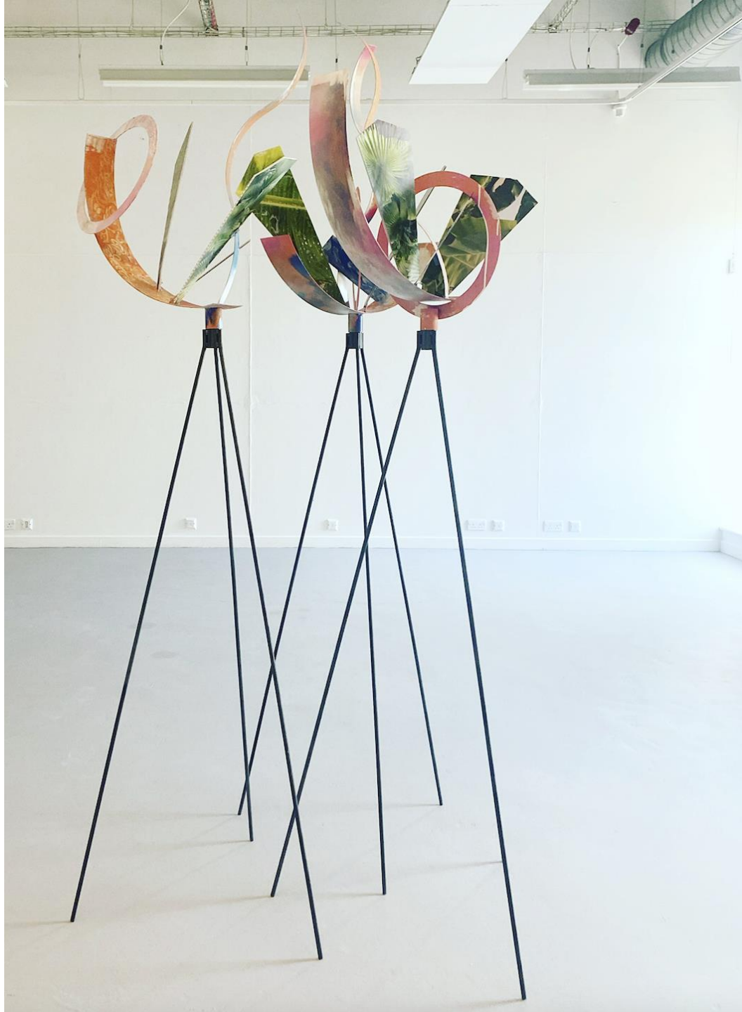
It's going to be okay Mixed media 2022