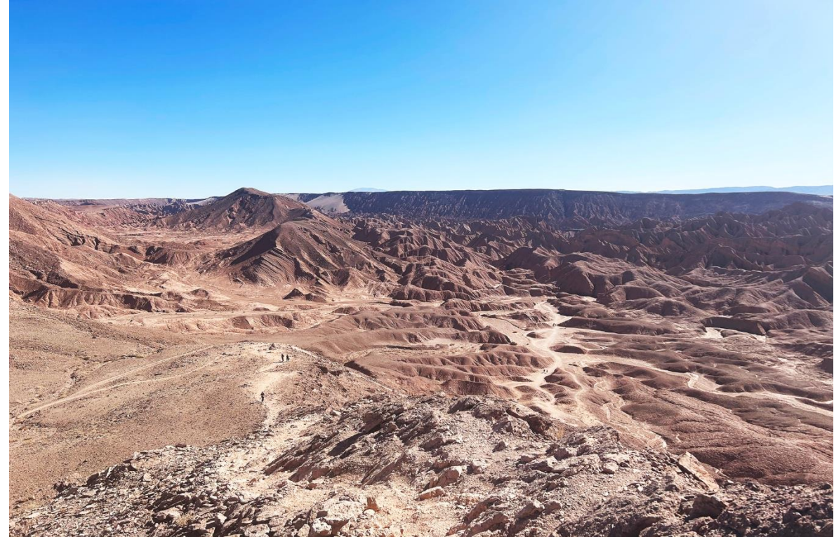
Atacama Desert, Chile.