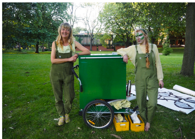
Fig. 4. A-R's and Art Cart.