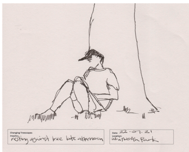
Fig. 6. Observational Drawing, Kerry Morrison.

For these visitors, the park was a potential link back to their biography of nature relationships, its cultural references and visceral