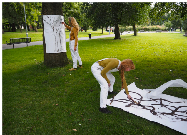
Fig. 5. Ash Tree Arting.

A group of black women gather around a picnic table laden with food and snacks