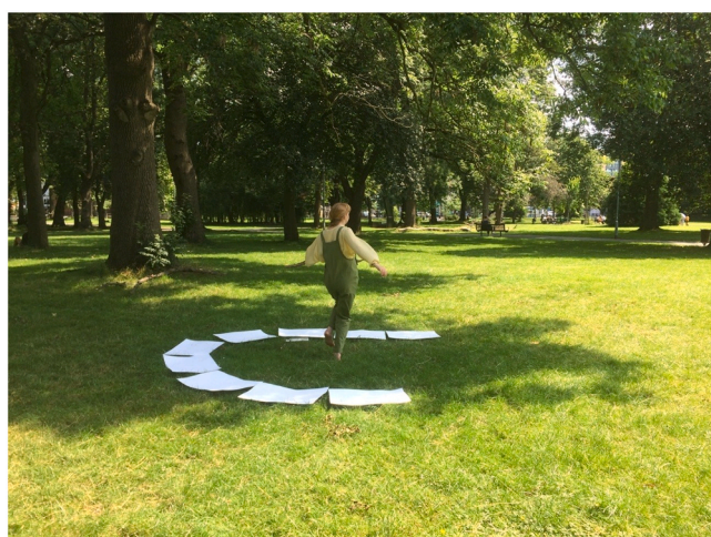
Fig. 2. Testing Methods in the 2021 July Heatwave.