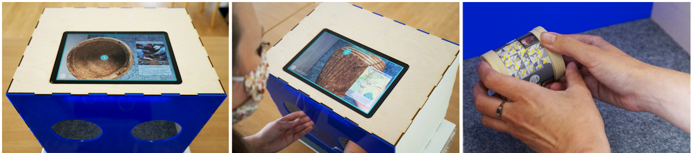
Figure 1: Left: ARcheoBox. Middle: A participant at user study. Right: A close-up of a participant hands inside ARcheoBox.