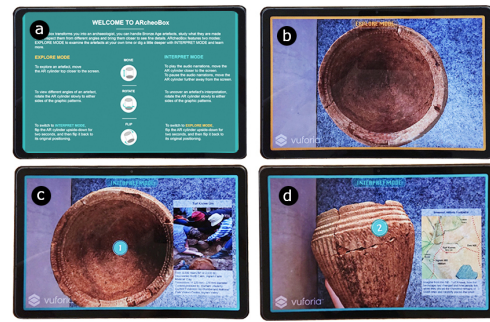
Figure 3: Screenshot of the welcome screen; b) virtual 3D model in Explore mode; c) Interpret mode showing artefact info; d) Interpret mode showing artefact map.

While we considered adding visual hints [44] such as floating text around the virtual 3D model or adding an extra AR marker as a controller [38] for the virtual environment, we anticipated that this would distract the user from the task at hand while manipulating the artefacts. Therefore, we opted not to add touch screen buttons. We wanted to keep the focus on the virtual representations of the historical artefact, while also being able to interact with interpretation using the same physical object.