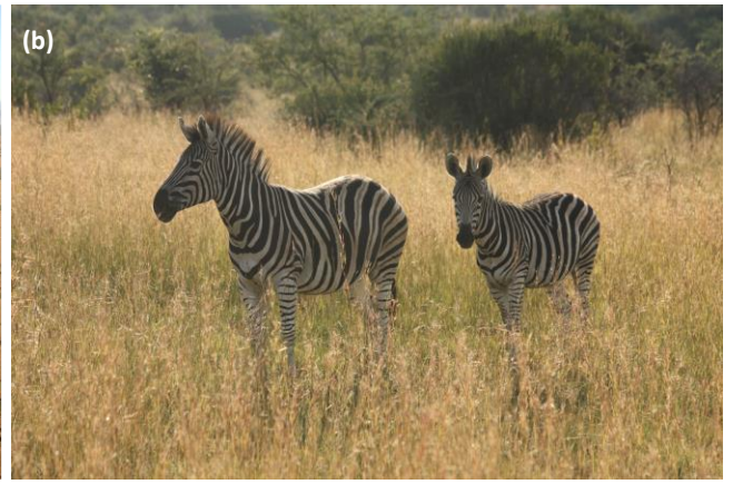
Figure 1: Study site from (a) air and (b) land showing typical habitat and visibility.