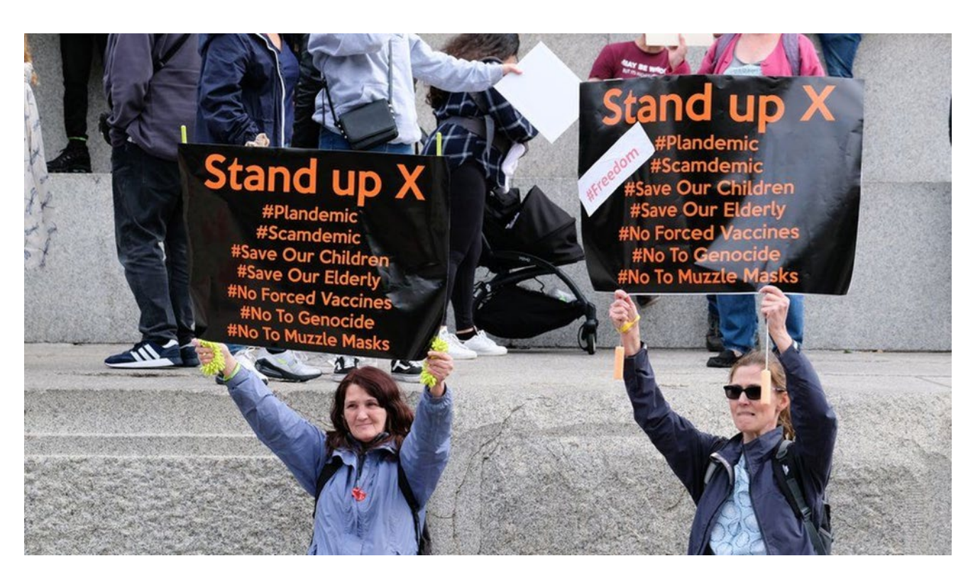
Anti-lockdown demonstrators in London, September 2020