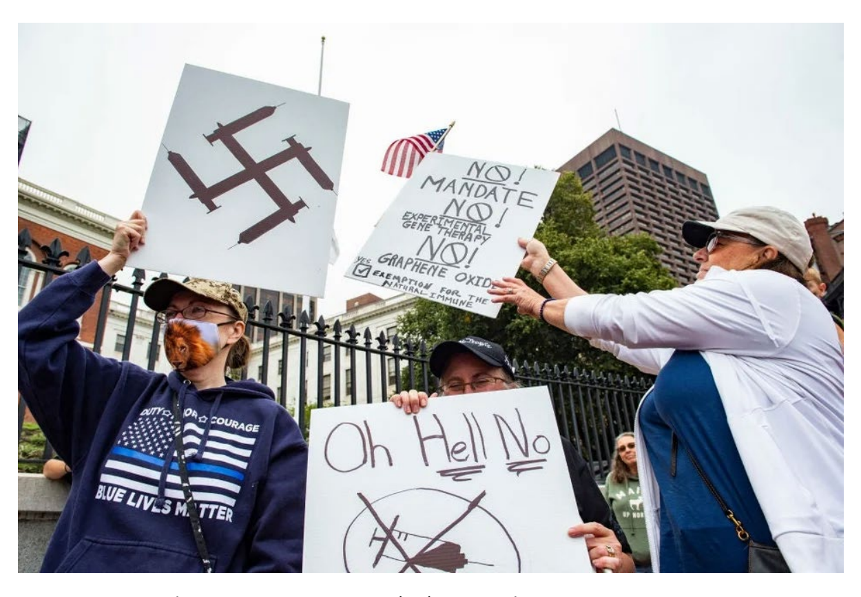
Anti-vaccination demonstration in Boston (US), September 2021