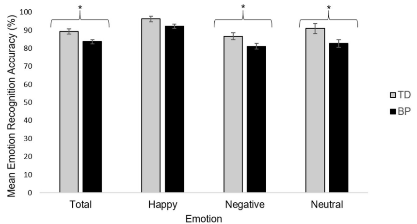
Fig. 2 Estimated marginal means of total, happy, negative and neutral emotion recognition scores. Error bars are set at \pm 1 standard error. * = p < .05 . TD = typically developing group, BP = behavioural problems group

Although the current study shows that self-esteem and emotion recognition are related, a hierarchical regression analysis found that self-esteem and emotion recognition predicted behavioural problems independently of one another. This suggests that while they are related processes, they are distinct risk factors for ASB. This has important implications when formulating interventions and treatment strategies for individuals displaying behavioural problems. Such strategies, and policy and practice decisions need to take into account that while self-esteem and emotion recognition are related process and risk factors for and correlates of ASB, they need to be considered separately.