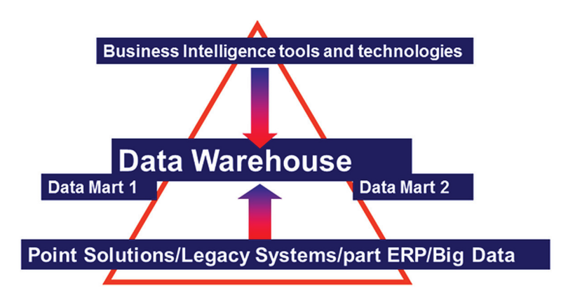
Figure 1. Typical systems architecture underpinning BI tools deployment

(Maria, 2005). It integrates the analysis of data with decision-analysis tools, with the purpose of improving strategic decisions. Although these tools may be used across an organization, it is often in the financial and management accounting areas of the business where BI applications are most in evidence. It is often these departments that are at the centre of strategic planning and knowledge management for the organization as a whole.