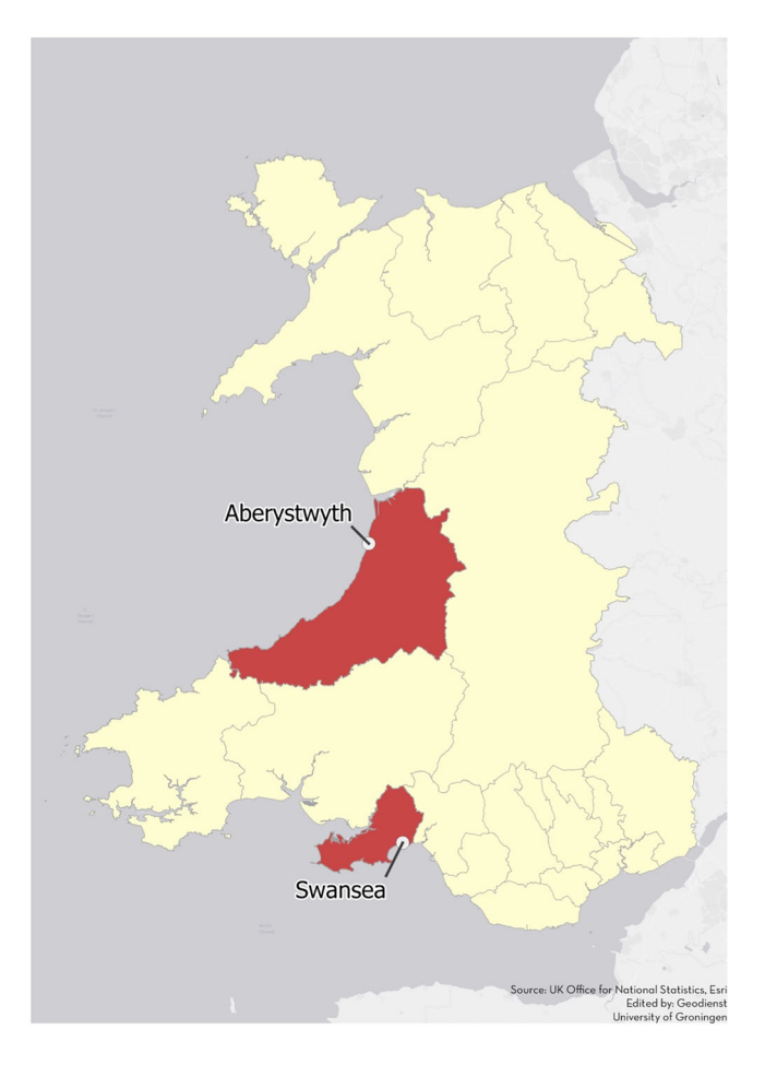
FIGURE 2 Ceredigion and Swansea study areas

holding residents in Ceredigion; we hence recruited German participants there. Most German respondents were women, reflecting German migration patterns to the region, according to respondents. Most came from fairly prosperous rural areas or large city regions and had (or were studying towards) a tertiary qualification. Respondents