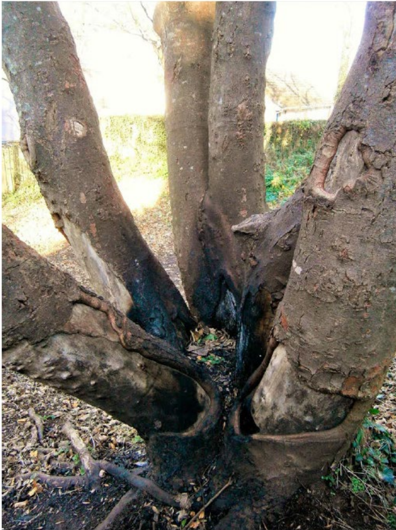
FIGURE 2 BURNT & BARK STRIPPED STEMMED SYCAMORE: CHILDREN'S ALTERNATIVE HEARTH AND HOME.