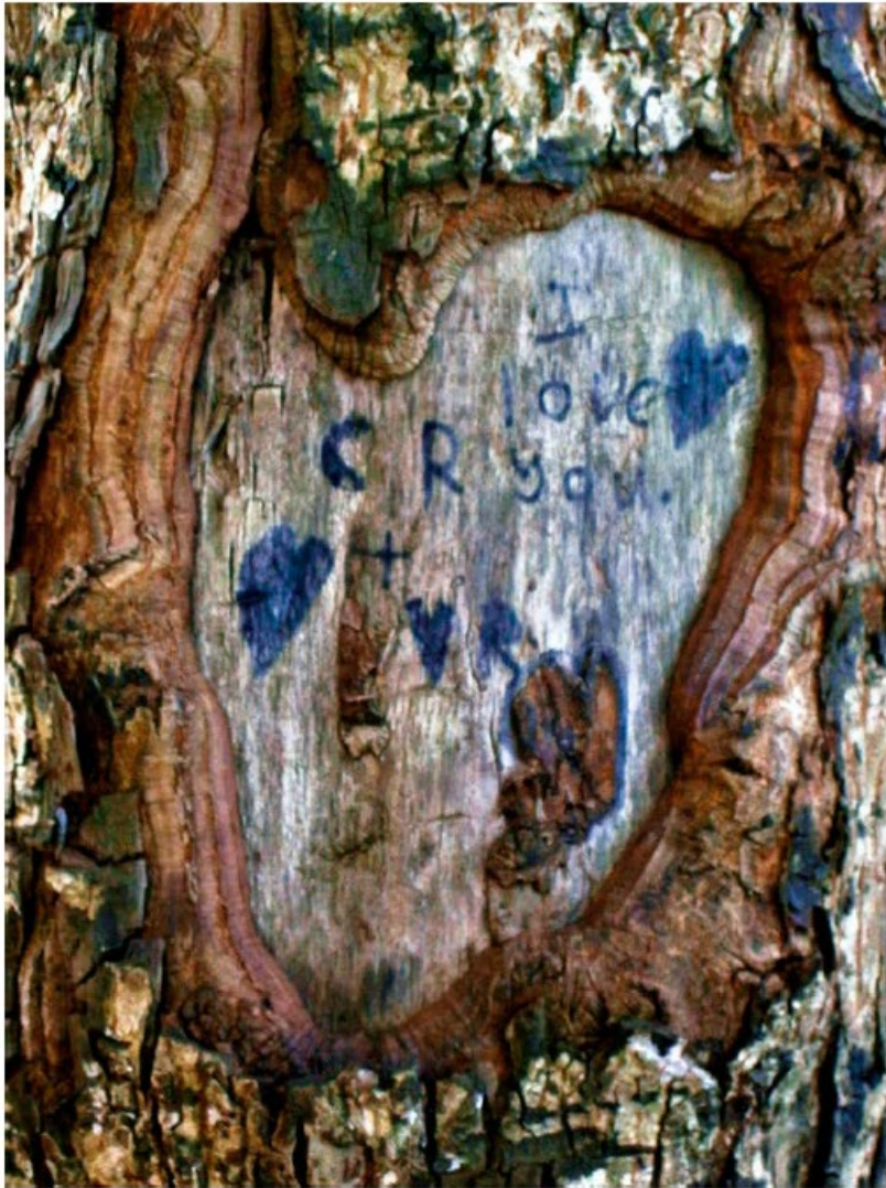
FIGURE 3 STRIPPED BARK AND INKED FIELD MAPLE: TREES HOLDING MESSAGES AND FEELINGS FOR CHILDREN.

he could sit and enjoy its views of FA and what his friend described as the 'fresh air' reached up there.