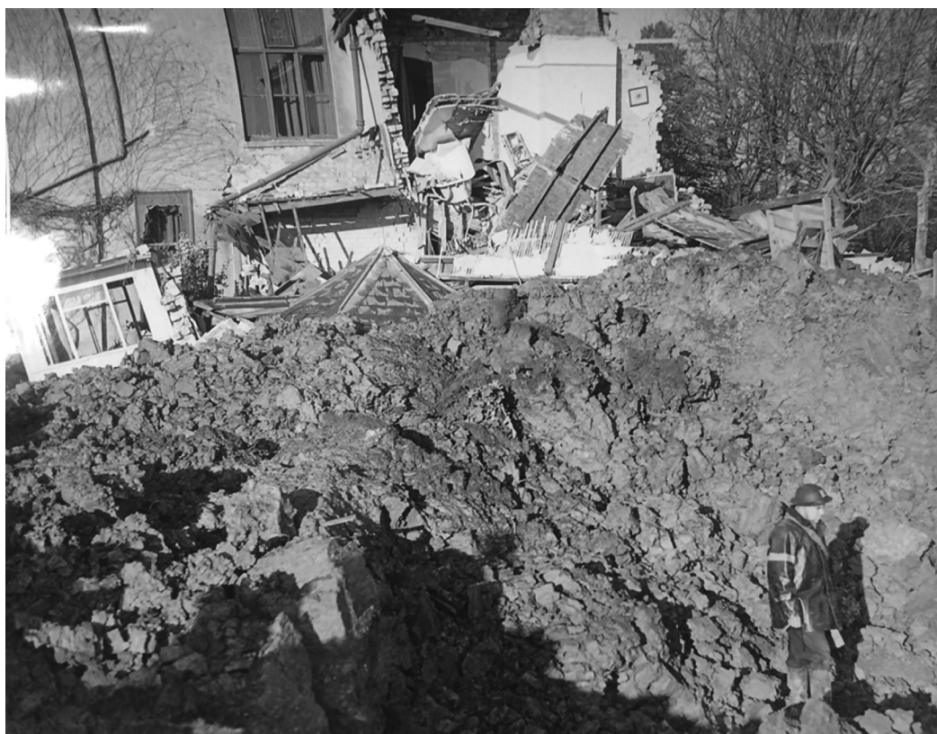
Figure 1: Enormous crater in a Christ Church Road garden where a bomb on 11 December 1940 partly destroyed the house Cheltenham Local and Family History Library, CW/Box N/PR110.22

carefully at the image before going on to make deductions and inferences, we began by asking the class to describe what they could see. This provided opportunities for us to extend period-specific vocabulary and practise picture reading skills. The children identified the demolished building, the mound of earth and the individual in uniform, then spontaneously concluded that the photograph was taken during World War II and that a bomb had caused the damage. Detailed questioning was important at this point to ensure that children were able to evaluate the evidence. Questions like 'What has happened?', 'Where exactly did the bomb fall?' and 'How do you know?' helped them to form and justify their opinions.