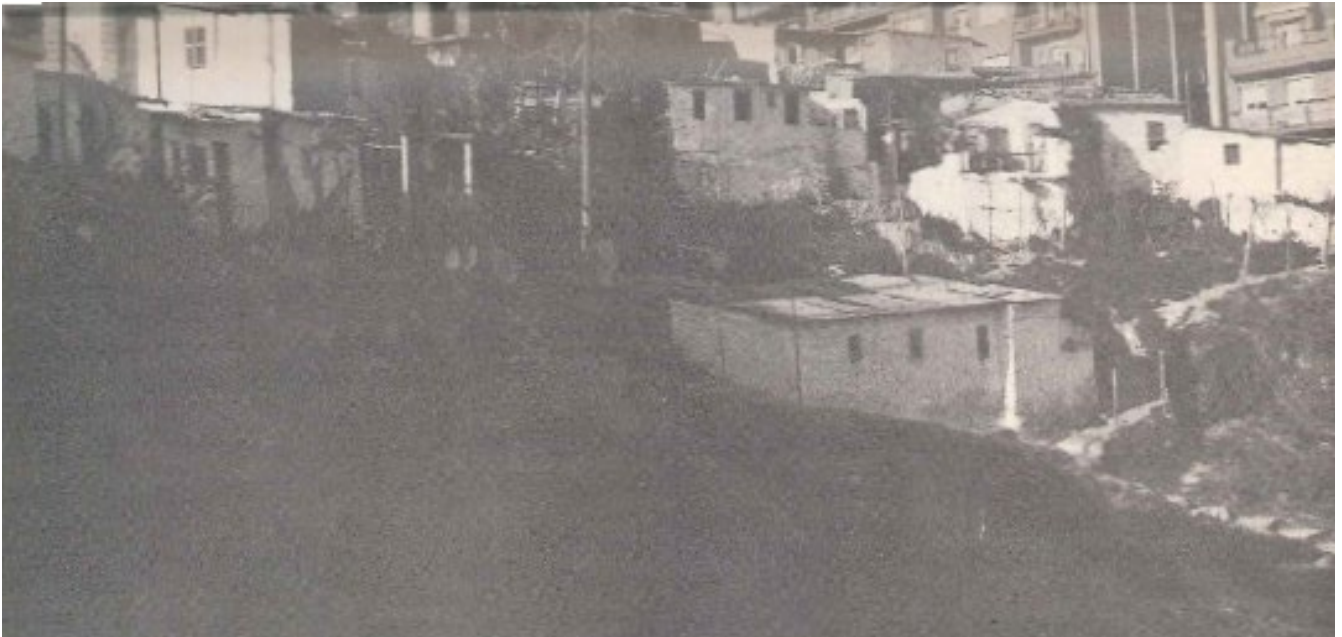
Figure 2. Ramon Casellas, Barcelona. These shanty dwellings are now being knocked down to make way for new two- and three-story structures that will house the existing community. The Residents Association, consultant architects, and local and central authorities have collaborated in the scheme. It is this type of problem-focused case study that may provide the most immediate scope for international exchange.

Examples of such innovatory schemes currently being documented include the Seixal shanty improvement and reconstruction scheme outside Lisbon, Portugal (Costa Lobo 1977, 1979), where shanty residents have been actively involved in the construction and financing of 500 new dwellings in collaboration with local authorities. A similar but smaller (200 houses) shanty redevelopment scheme is being employed in Ramon Casellas, in the Barcelona periphery (Wynn 1979). (See figure 2.) It is this type of problem-focused case study that provides more immediate scope for worthwhile exchange between the less developed European countries and the Third World.