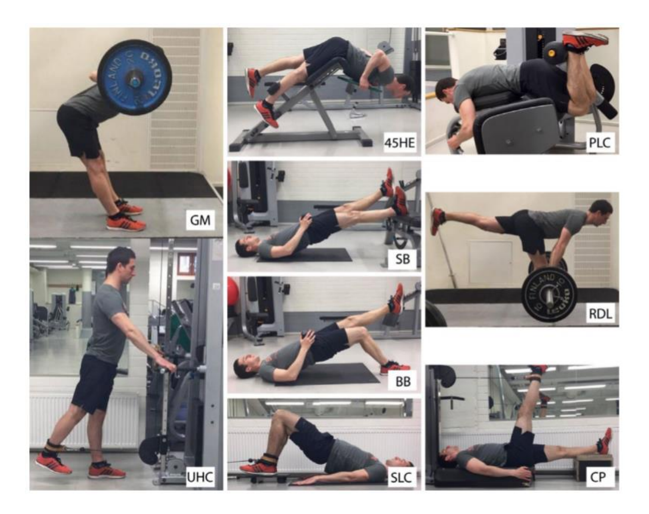
Figure 1 Nine typical rehabilitation exercises examined in this study. GM, good morning; RDL, unilateral Romanian deadlift; CP, cable pendulum; BB, bent-knee bridge; 45HE, 45° hip extension; PLC, prone leg curl; SLC, slide leg curl; UHC, upright hip extension conic-pulley; SB, straight-knee bridge.

In the main testing session, after preparation and warm- up, participants performed knee flexion and hip extension MVICs for the purpose of EMG normalization, followed by 6 repetitions of each exercise in a random order. The warm-up consisted of cycling, dynamic stretching (5 minutes each), and then 10 submaximal hip extension and knee flexion contractions performed in a custom-made dynamometer (UniDrive, University of Jyväskylä), <sup>24</sup> with the intensity increasing from ~30 to ~90% MVIC. In the dynamometer where MVICs were performed, participants lay prone with the trunk and hip fixed to the dynamometer bench in neutral position. In the dominant (measured) leg, the knee joint was positioned in 20° of flexion while the other leg was extended. For knee flexion MVICs, the lever arm of the dynamometer was fixed ~5 cm above the lateral malleolus. For hip extension MVICs, the lever arm was strapped just above the knee joint fold, and participants were asked to maintain 20° of knee flexion, which was confirmed before each contraction using a goniometer. For both hip extension and knee flexion MVICs, two repetitions were performed, followed by a third if peak torque differed by >5% between the first two contractions. For each contraction, maximum effort was maintained for 2 seconds and 2 minutes rest was applied between contractions. A