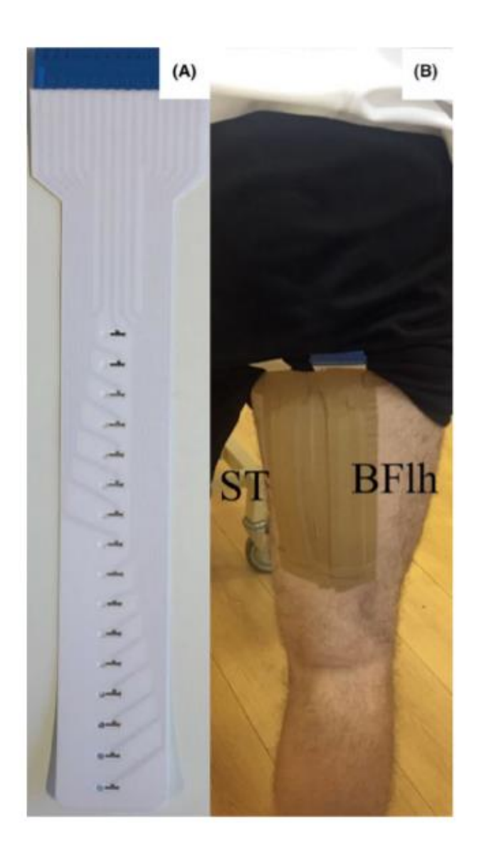
Figure 2 High-density electromyography (HD-EMG) arrays (A) were attached and secured (B) over the semitendinosus (ST) and the long head of the biceps femoris (BFIh) to comprehensively describe muscle activity levels during each exercise.

During MVICs, hip extension and knee flexion forces were measured with the dynamometer strain gauge at a sampling frequency of 1000 Hz, digitized (EMG-USB 12-bit A/D converter, OT Bioelettronica) and recorded in BioLab software in synchrony with the EMG signals. Lever arms were measured to calculate torque. For hip extension, the lever arm was measured as the distance between the trochanter major and the middle of the strain gauge. For knee flexion, the lever arm was measured as the distance between the lateral epicondyle of the femur and the middle of the strain gauge. During muscle contractions, force-time curve feedback was provided.