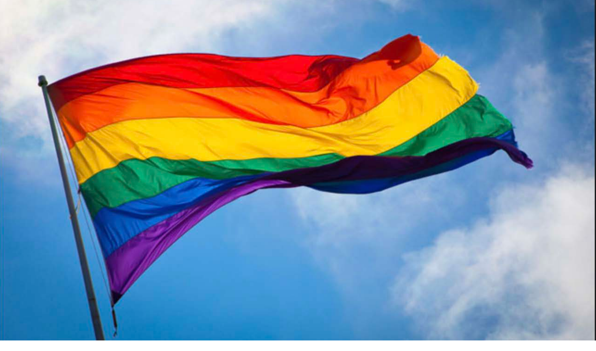
Examining homophobia in female elite team sports