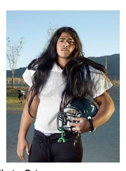
10. Catherine Opie Rusty, 2008