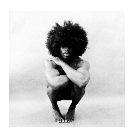
12. Rotimi Fani-Kayode Untitled, 1985 © Rotimi Fani-Kayode Courtesy of Autograph, London