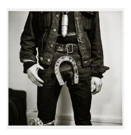
11. Karlheinz Weinberger Horseshoe Buckle, 1962