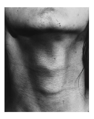
4. Sam Contis Untitled (Neck), 2015