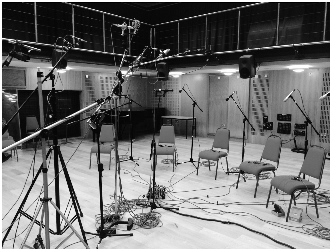
Figure 2: Initial microphone test.

However, the focus for Online Orchestra was different, and during this first phase of the project, priority was given to capturing instrumental sources with as little colouration from their room acoustics as possible. Distant microphone arrays would present significant problems with regard to feedback and, for these reasons, any use of