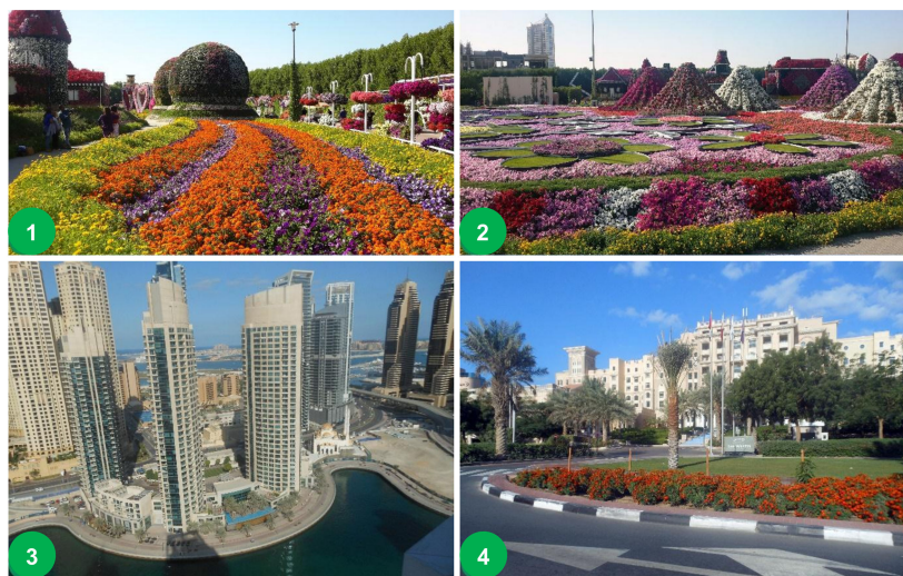
Figure 3. Dubai, UAE: (1) Dubai Miracle Garden with surrounding ‘green’ wall barrier in background, (2) Dubai Miracle Garden with integrated shading structures, (3) Dubai Marina with high-rise buildings and green rooftops, (4) Dubai Streetscape (Photographs taken by A. Russo, 13 November 2015).

a water scarce area, which fronts exceedingly high maintenance costs and irrigation requirements (Figure 3). A policy intervention that considers alternative ecologically oriented design is urgently required in much of the Middle East. One failed example, is a lack of policy for landscape designers in utilising native plant species [52]. To our knowledge, Abu Dhabi, UAE, is the only major Middle Eastern city focussing on such regulations by way of its innovative green standards. Its design methodology, named ‘Estidama,’ the Arabic word for sustainability, constructs and operates buildings and communities by imposing building codes that are green-friendly, while still recognising its unique regional needs and expansive demands [53].