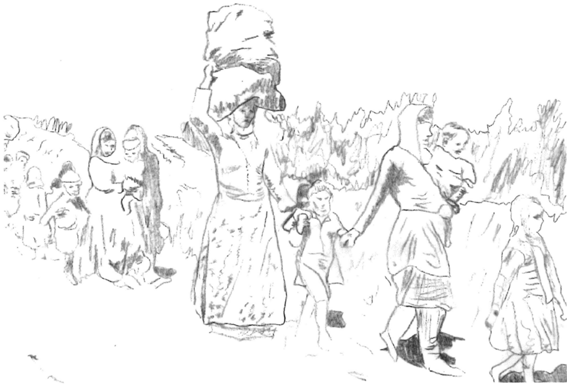
Figure 4: Ariella Azoulay (2012). Unshowable Photographs: Different Ways Not to Say Deportation , (Evacuation of their own 'free will' Tantura-Fureidis- Transjordan). Detail. © Ariella Azoulay, Fillip Editions.

Evacuation of their "own free will" (Tantura–Fureidis–Transjordan)