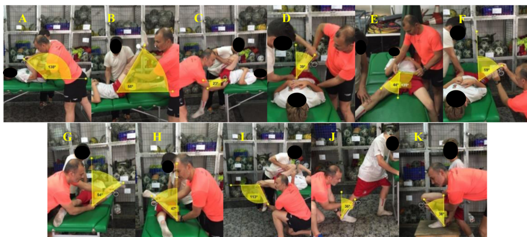
Figure 1 Lower extremity ranges of motion of the “ROM-SPORT” protocol. (A) Hip flexion with knee flexed test (HF-KF); (B) Hip flexion with knee extended test (HF-KE); (C) Hip extension test (HE); (D) Hip adduction with hip flexed 90° test (HAD-HF90°); (E) hip abduction with hip neutral test (HAB); (F) hip abduction with hip flexed 90° test (HAB-HF90°); (G) Hip internal rotation test (HIR); (H) Hip external rotation test (HER); (I) Knee flexion test (KF); (J) Ankle dorsiflexion with knee extended test (ADF-KE); (K) Ankle dorsiflexion with knee flexed test (ADF-KF).