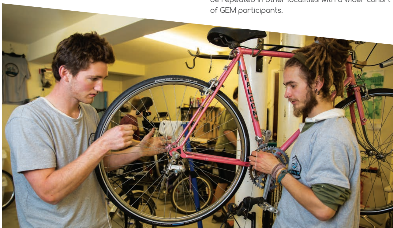
GEM participants taking part in the Access Bike workshop in Stroud, which finds unwanted bikes, trains young people to fix them up and gives them to people who need them

The team will have completed all the pilots by the end of October and have proposed meeting with the monitoring and evaluation team in November to examine the material created, discuss how to share findings, and to consider if and how the pilots will be repeated in other localities with a wider cohort of GEM participants.