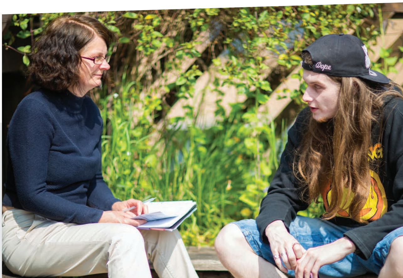
Navigator Developer Anna with a participant for a mentoring session

Results from the 2018 retrospective survey were used to update the forecast SROI model, a summary of which is given in Table 2. This demonstrates a 53% improvement in the prospective societal return of GEM, which the BIR rising to 1: 2.39.