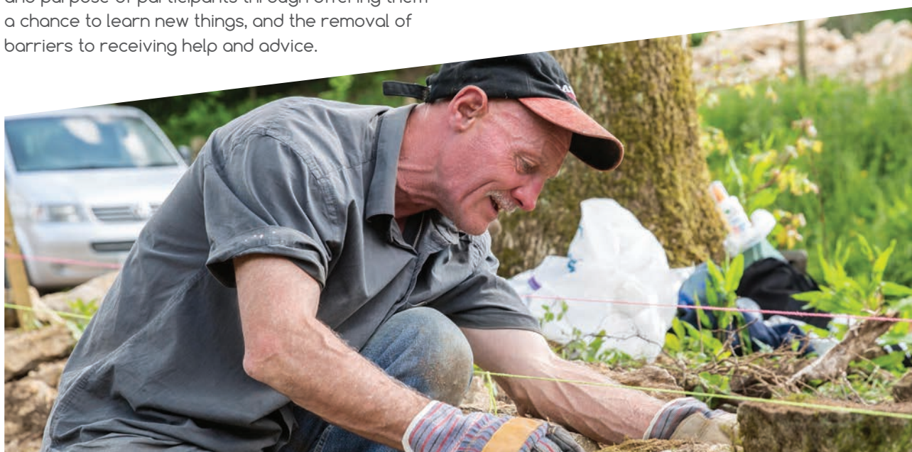
A GEM participant takes part in a drystone walling taster day

More generally, the analysis reaffirms that GEM continues to positively impact the sense of purpose and the opportunity to learn new things, gain confidence and have motivation to access new opportunities, and improvised resilience, positive functioning and coping strategies of its participants, all longer term outcomes identified in the ToC model (Figure 2). Thus, the impact of GEM on the personal functioning and motivational attributes of participants is both required and significant and can be linked to both BBO and GEM outcomes.