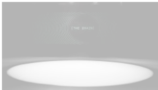
[The Brain] 24 Nov 2018 at 20:00

Discover what it's like to be part of a collective brain: a self-organizing, complex system that generates autonomous output.