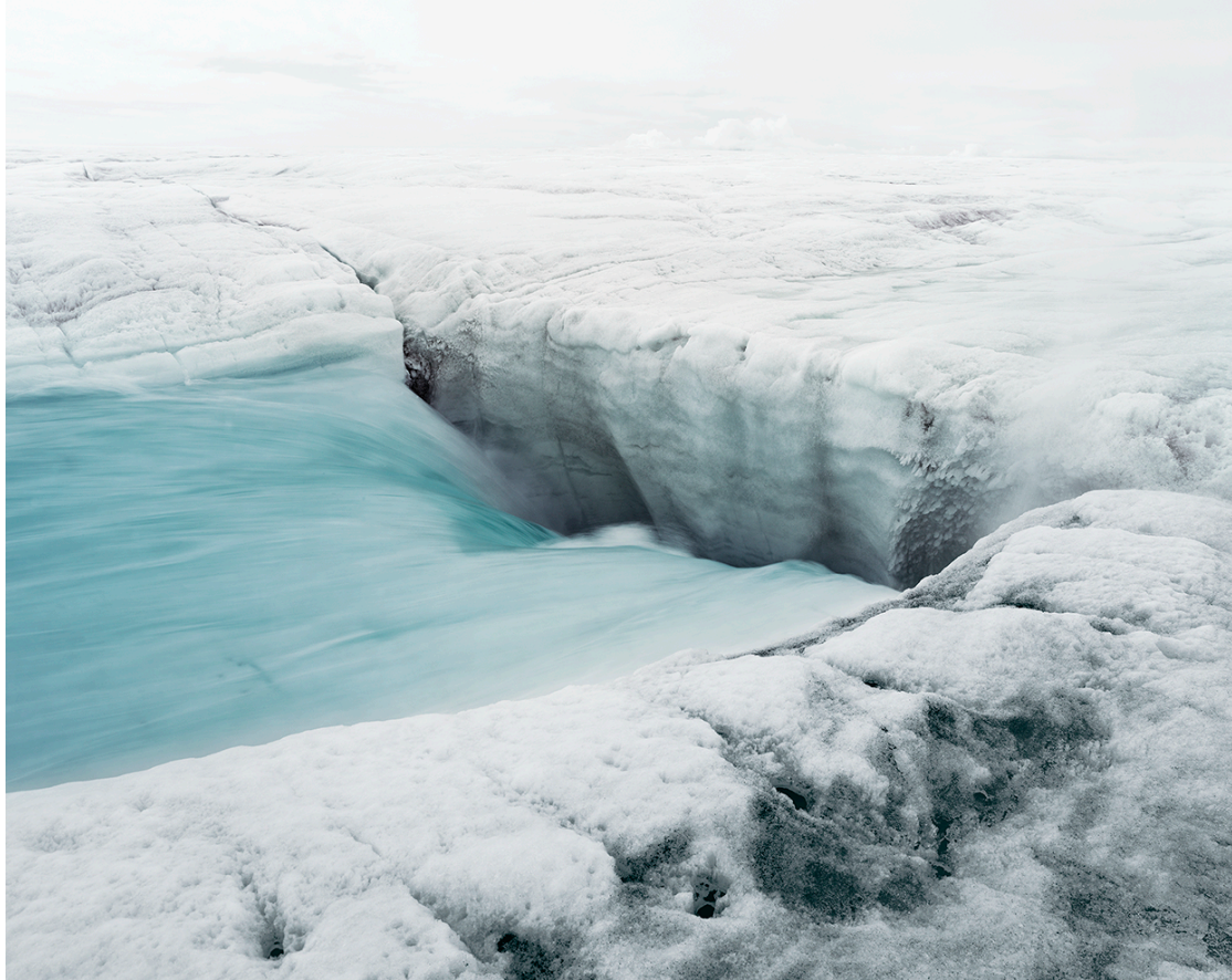
Fig. 1 River 02, 07/2008, Position 16 69°46'33"N, 49°42'20"W, Altitude 870m, by Olaf Otto Becker

the collapse of the Greenland ice sheets, but also to visualise the difficulty of comprehending the scale of glacial retreat [fig. 1].