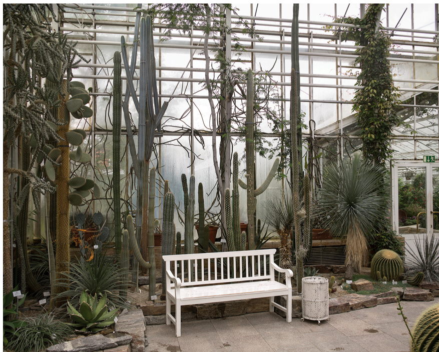
Fig. 4 Greenhouse, Munich Botanical Garden, 05/2014, by Olaf Otto Becker

Becker reflects on the materials in his own living and working environment that have originated from the forests that he has photographed (2014: 150) and his imagery can be also be read as a sustained critique of neoliberalism, one that acknowledges his own role within neoliberalised economies and contexts. In the second section of Reading the Landscape , a series of images depicts cleared and burned forest. The captions to the images are significant even though they are at the back of the book. Becker provides information about the value and extraction of hardwood timbers, which are removed first and with fewer devastating effects for the forest. After the valuable timbers are removed, widespread burning is used to clear land so that acacia and palm oil plantations can be created; the logging and fire burning is often undertaken illegally (ibid: 150-1). Becker notes that local people are often poor and unable to prevent logging and burning, but Becker also documents instances of resistance and activism, and indeed activists facilitate his access to the forests (ibid: 151). Becker also notes the ways in which tropical plants are used in decorating the cities in Singapore and other new city constructions. In this way Becker is reflecting on the raw materials of nature that are exploited as resources and commodities. Importantly, Becker concludes his book with an image of a botanic garden: not a modern theme-park garden, but an old one in Munich, Germany [fig 4].