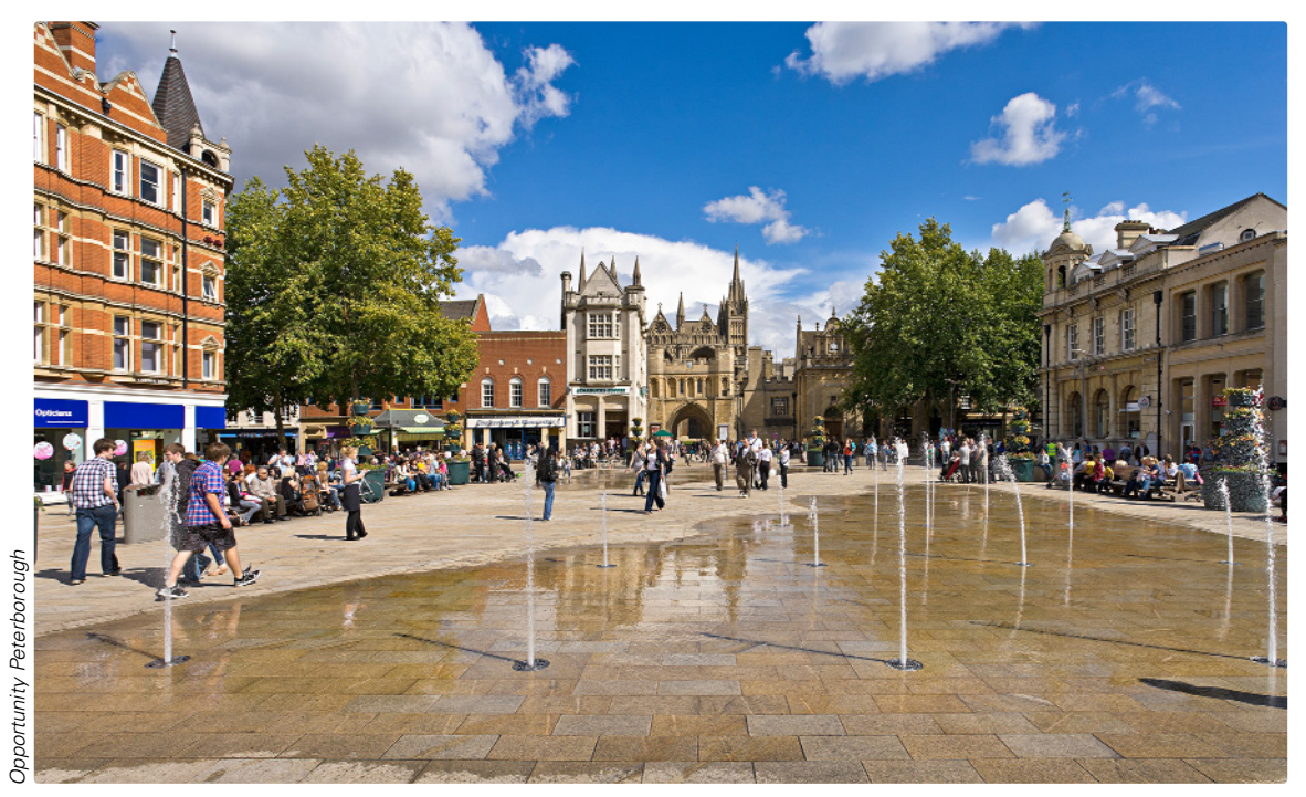
Peterborough's circular city approach focuses on the '7 Rs' of rethink; redesign; repurpose, re-use and share; repair; remanufacture; recycle; and recover