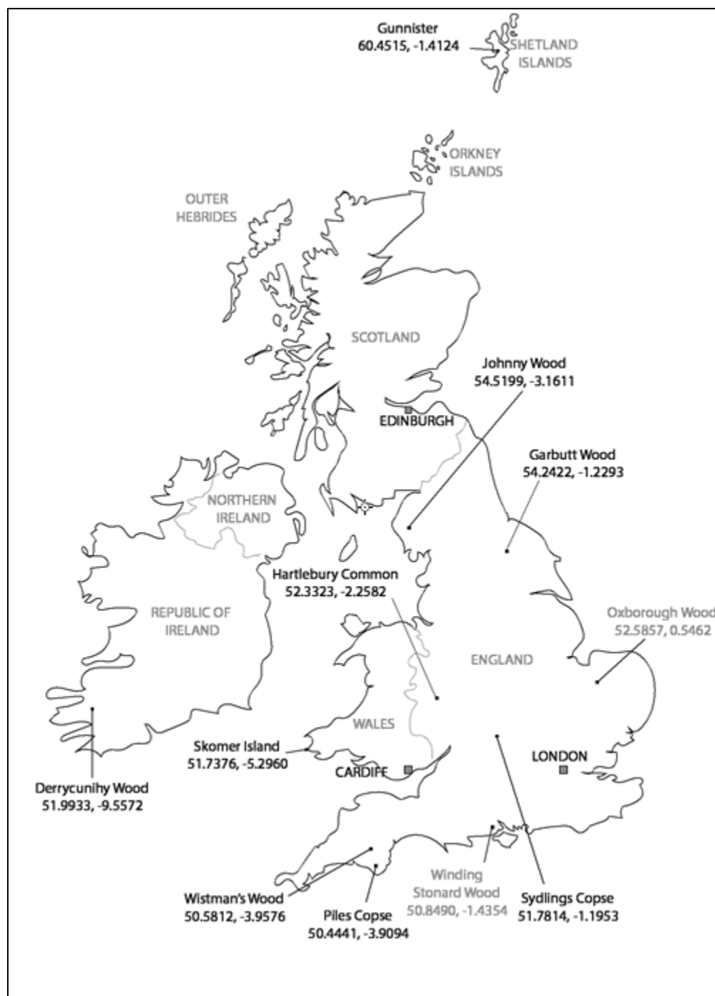
Figure 1. Location of main study sites (black text) and additional sites (grey text).