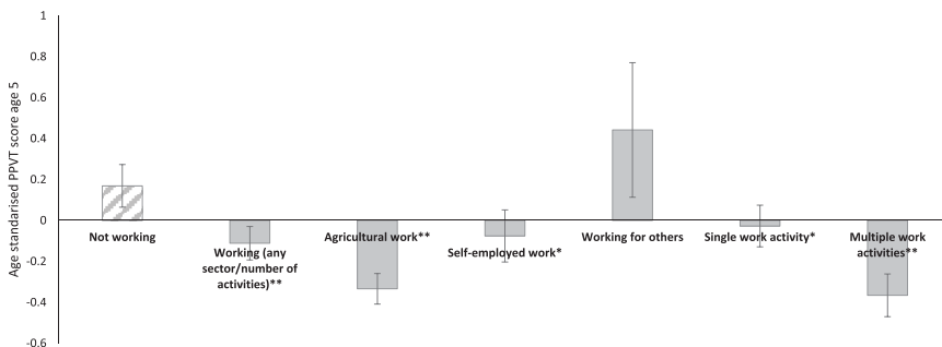
Figure 1. Mean (+/-95% C.I.) age-standardized PPVT score at age 5 by maternal work characteristic during child's first year of life. Note: Asterisks show independent sample t-test result for children with each maternal work characteristic relative to the 'not working' group. ** p < 0.001 , * p < 0.05 .

Figure 1 displays the mean age-standardized PPVT score for children at age 5 by maternal work characteristics during the child's first year of life. Children whose mothers were engaged in agricultural work, self-employed work, single or multiple work activities had significantly lower PPVT scores at age 5 ( p < 0.05 ). Although the mean PPVT score of children whose mothers were defined as 'working for others' in this sample is higher than the mean PPVT score for children whose mothers did not work, there is a large margin of error and the t-test indicated that the difference is not statistically significant.