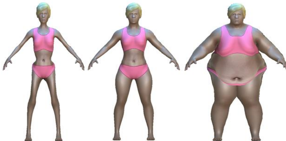
Figure 1: 3D Avatar illustrating the underweight – average – obese continuum (anterior).

The questionnaire that was used was not pre-validated and was designed in line with literature relating to body image and body dissatisfaction amongst females [22]. A pilot study was conducted prior to data collection to reduce the risk of participants' confusion and to ensure their understanding of the given questions. In doing so, it reduced any risk of typing/wording errors, respondent confusion and bias [1]. The questionnaire consisted of closed questions and was presented in 3 parts (A: personal details; B: Calculated BMI and C: Perceived Body Image). Whilst the preferred approach to this study would have been to use a 3D image of a woman that is able to rotate 360° and can visually slide from underweight to average to obese continuum, this was unable to take place due to COVID-19 pandemic. The software for the computer generated avatar was unable to be accessed, therefore, alternative 2D screen shots were taken illustrating 10 different images (ranging from anterior, lateral, and posterior and from underweight to average to obese continuum) (see Figure 1). Participants were asked to identify one of the images which best represented their body, thus their perceived BMI.